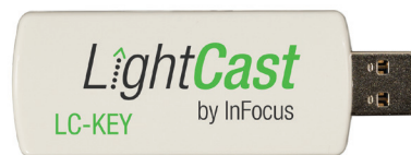
LightCast Key unlocks casting, whiteboard and browser

Command and control your IN5148HD with free ProjectorNet 4.0 software from InFocus. Projector Net allows you to remotely manage and support your projector from a single computer via your existing network.