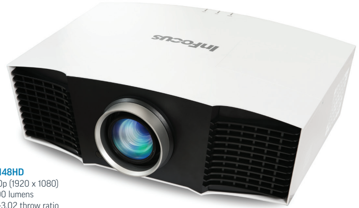
IN5148HD 1080p (1920 x 1080) 5,000 lumens 1.49-3.02 throw ratio