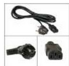
Power / Electrical