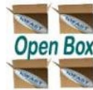
Open Box / Custom