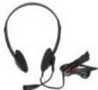
Audio / Video