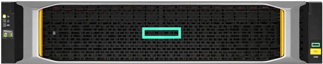
HPE MSA 2060 Storage

The HPE MSA 2060 is a flash-ready hybrid storage system designed to deliver hands-free, affordable application acceleration for small and remote office deployments. Don't let the low cost fool you. It gives you the combination of simplicity, flexibility, and advanced features you may not expect in an entry-priced array. Start small and scale as needed with any combination of solid state drives (SSDs), high-performance Enterprise SAS HDDs, or lower-cost Midline SAS HDDs. With the ability to deliver 325,000 IOPS, the new MSA 2060 is up to 45% faster than its prior generation with ample horsepower for even the most demanding workloads.