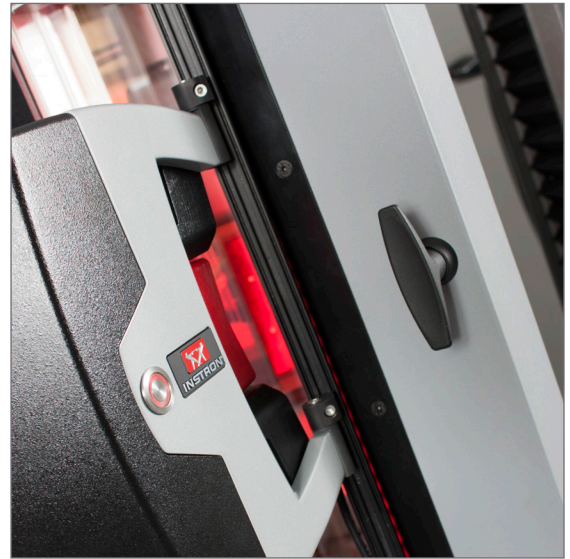
AVE 2 Mounted on a Temperature Chamber