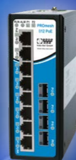
PROmesh B12 PoE