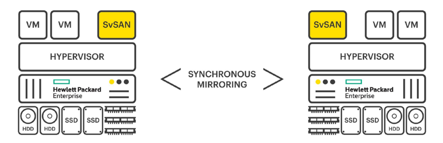
Figure 1 StorMagic Solution Architecture

The StorMagic solution via HPE Complete provides small sites with lightweight highly available storage, delivering 100% uptime for mission critical applications in edge sites, remote and branch offices and small datacenters.