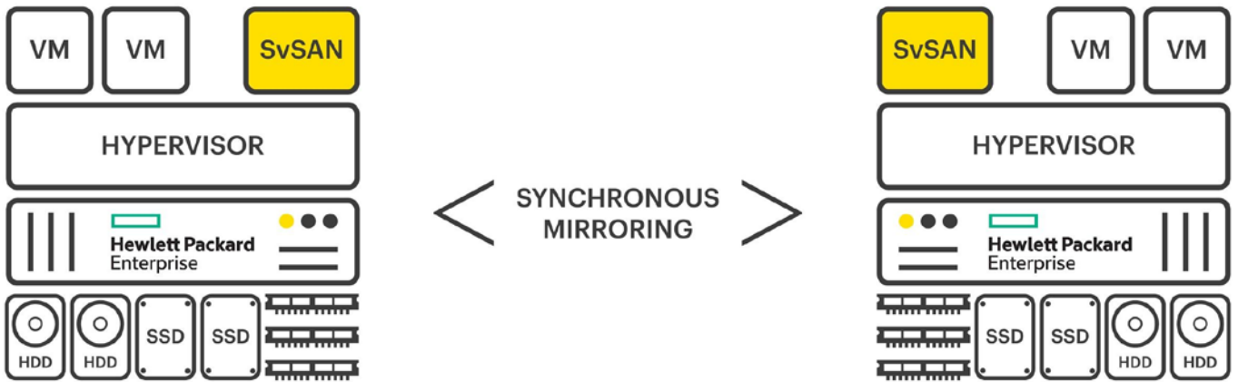
Figure 1 StorMagic Solution Architecture

The StorMagic solution via HPE Complete provides small sites with lightweight highly available storage, delivering 100% uptime for mission critical applications in edge sites, remote and branch offices and small datacenters.