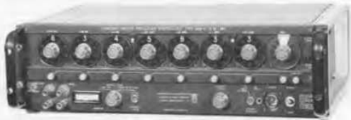
TYPES 1161-A AND 1162-A COHERENT DECADE FREQUENCY SYNTHESIZERS

Descriptions of these instruments will appear in the September issue of the General Radio Experimenter .