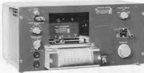
TYPE 1521-B GRAPHIC LEVEL RECORDER

These instruments are described elsewhere in this issue.