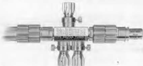
The Type 900-TUA Tuner installed between a coaxial line and a matched termination.

Types 900-WNC and -WNE Short-Circuit Terminations . The former is de-