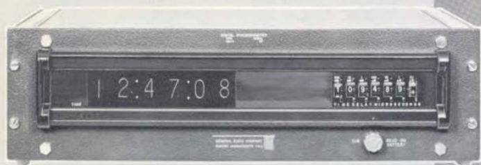
TYPE 1123-A DIGITAL SYNCHRONOMETER