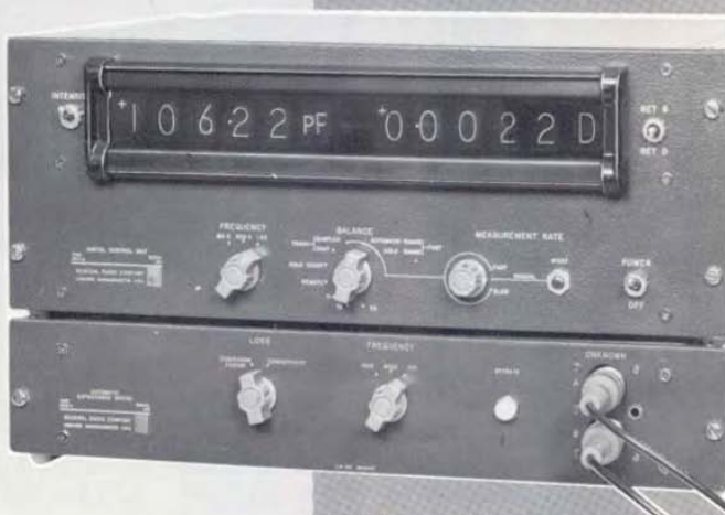
TYPE 1680-A AUTOMATIC CAPACITANCE BRIDGE ASSEMBLY