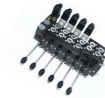
Pressure compensated control valve: HAWA PSL2