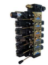
Pressure compensated inlet section: BOSCH