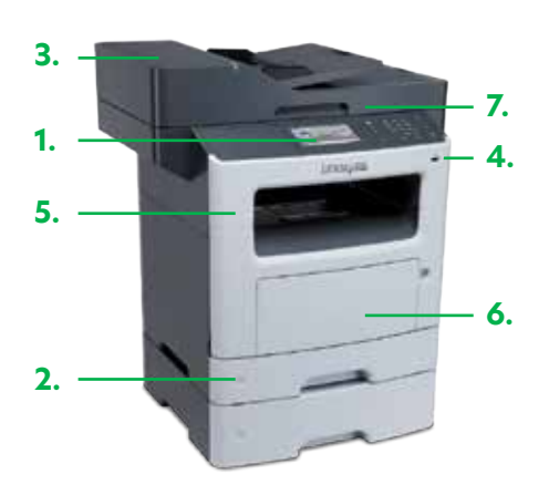
XM1145 with 4.3-inch color touch screen