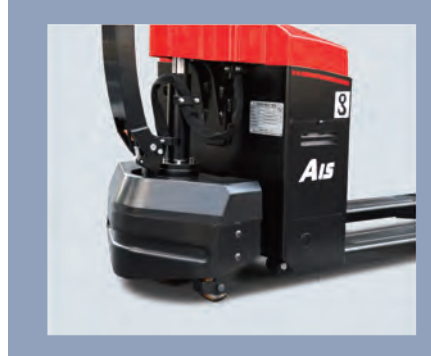
Auxiliary Wheels are Equipped to Increase Stability