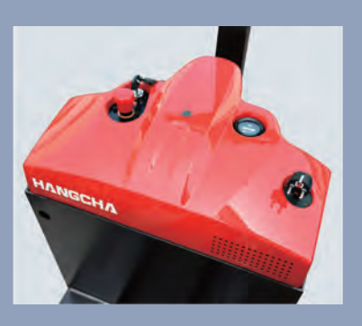
Modern Industrial Desi