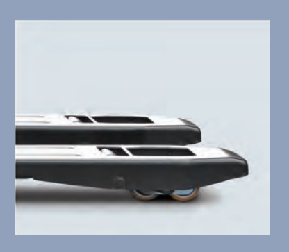
Single Load Whee