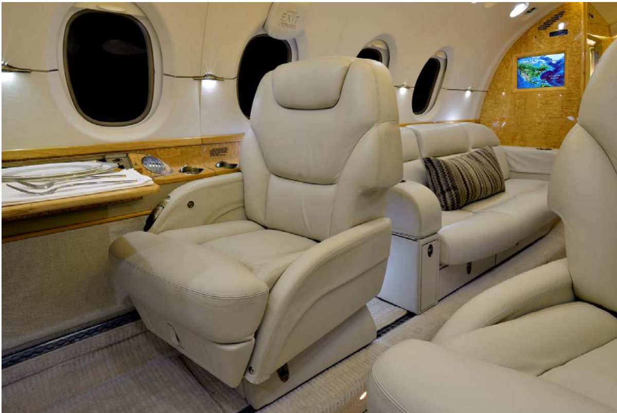
Right Hand Seat Facing Forward