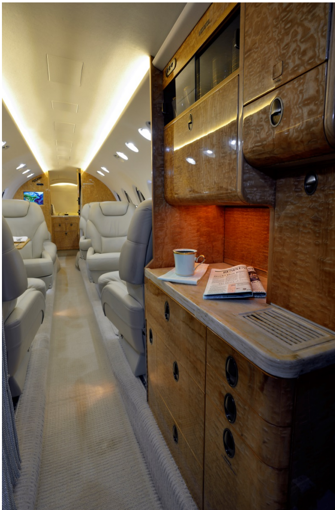
Forward Refreshment Center