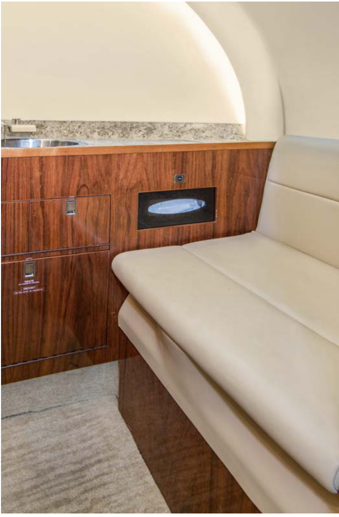
Forward Refreshment Center