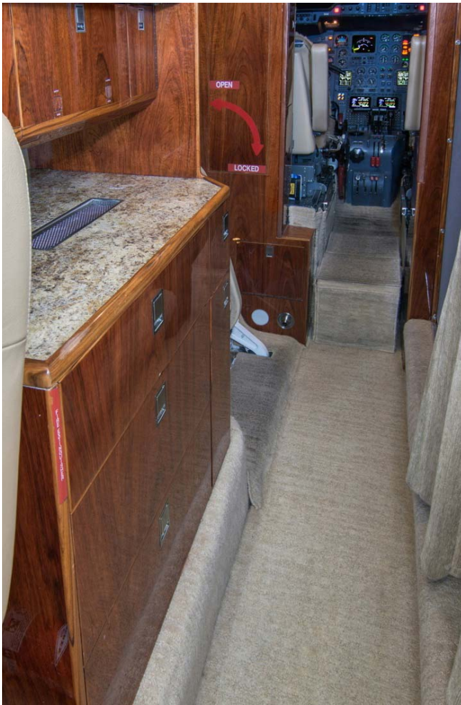
Forward Refreshment Center