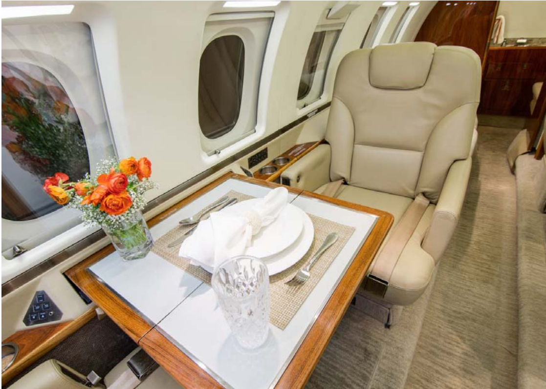
Right Hand Seat facing Forward