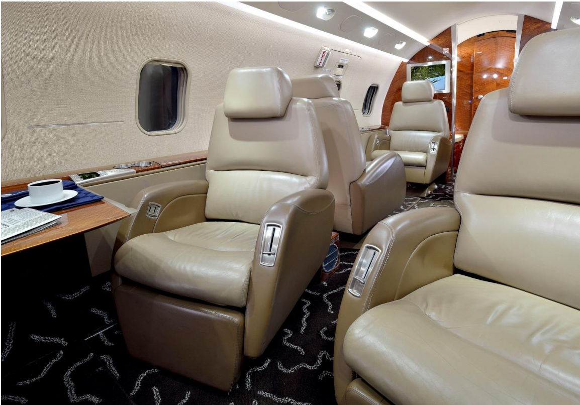
Right-Hand VIP Seat Facing Forward