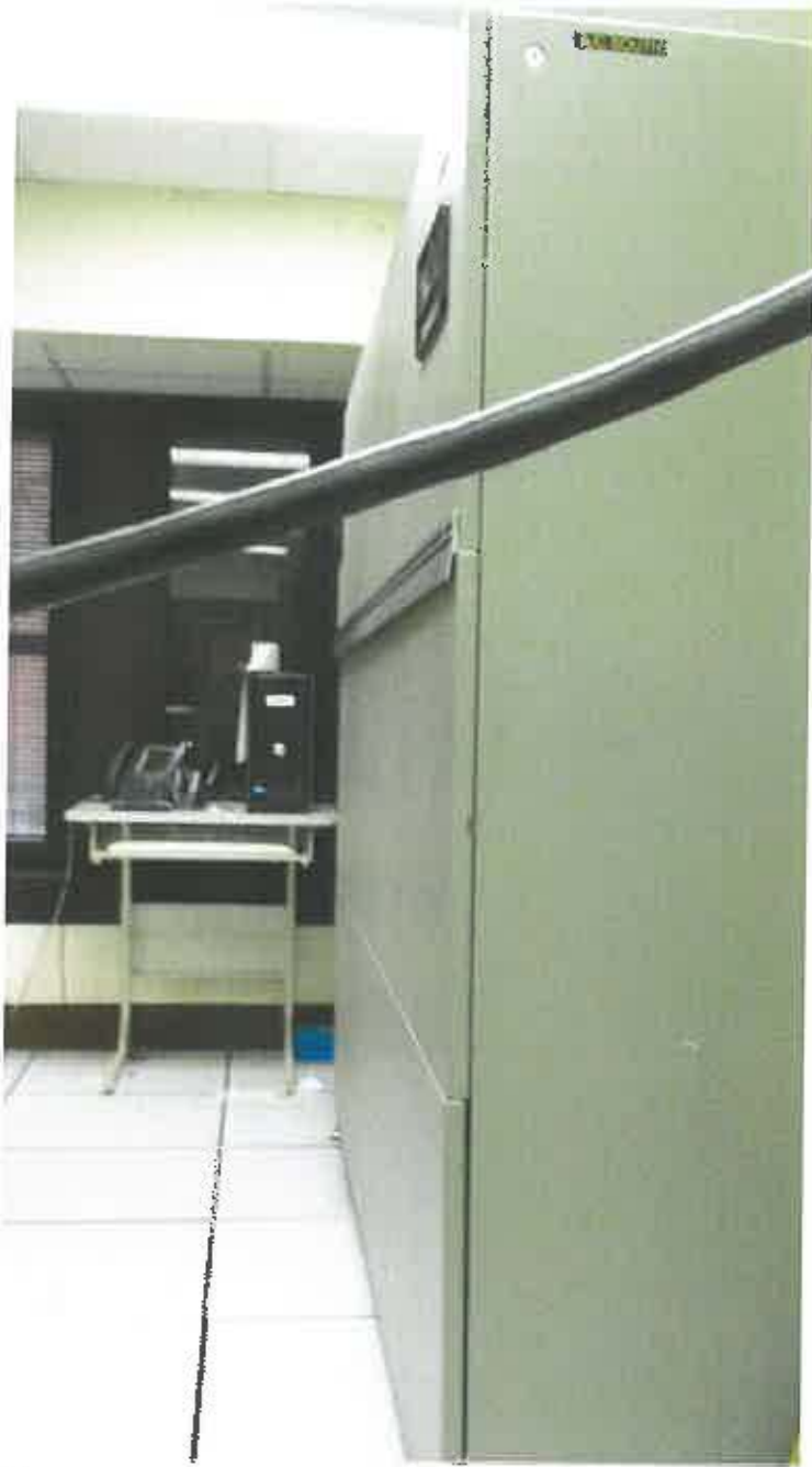
Building 1, IRMS, Liebert 20 Ton