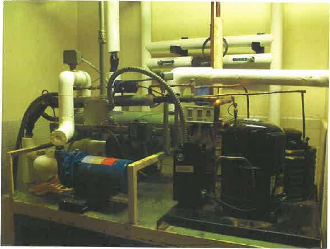
Building 1, BC-102 Water Cooler