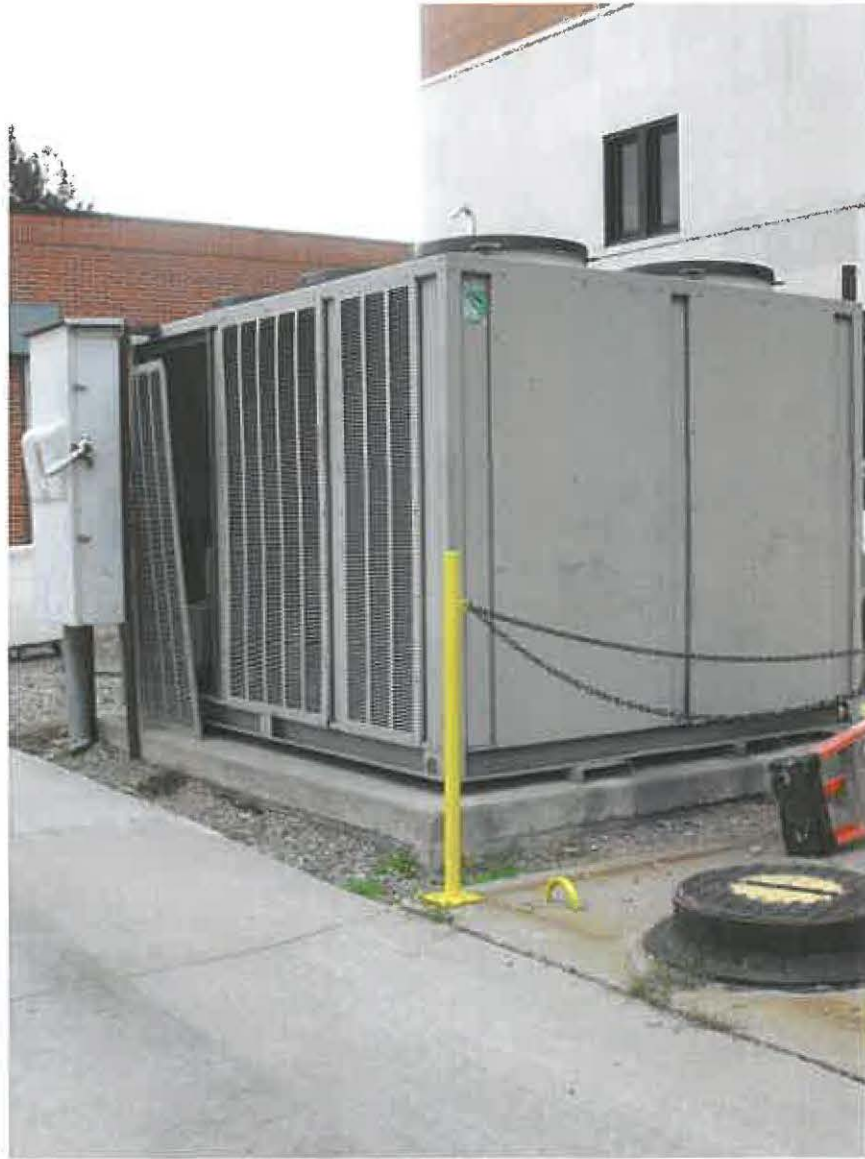
Building 38, Trane 60