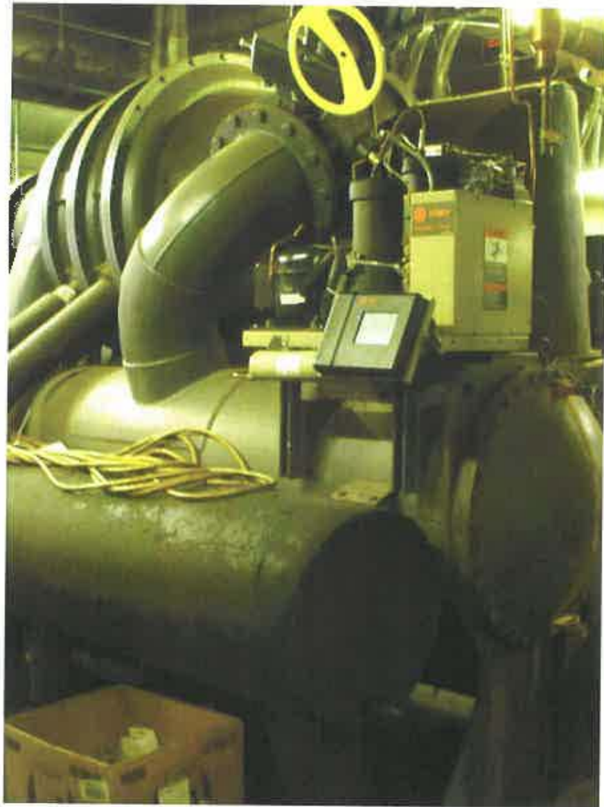
Building 1, Chiller Room, Trane 500 Ton