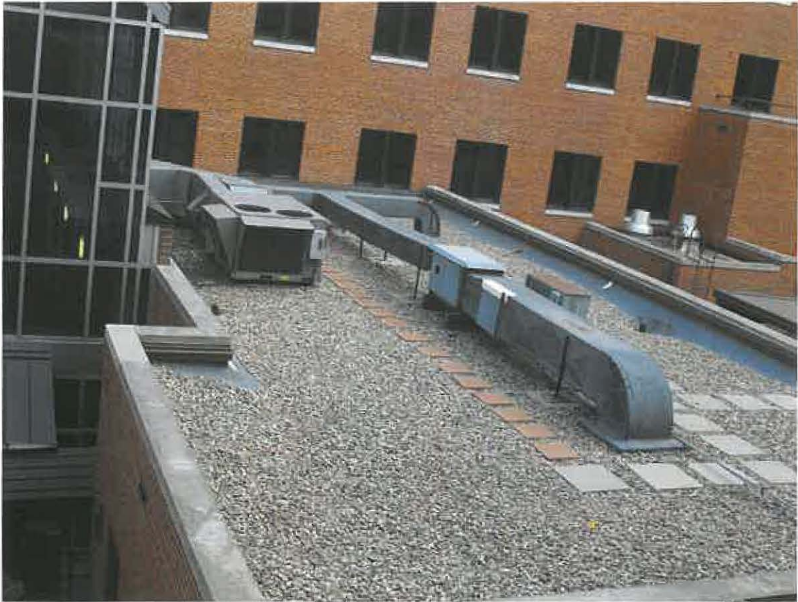
Building 1, Atrium, Roof of Chapel, Carrier and Bryant