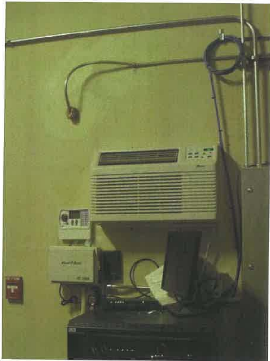
Building 38, Room 113, Amana