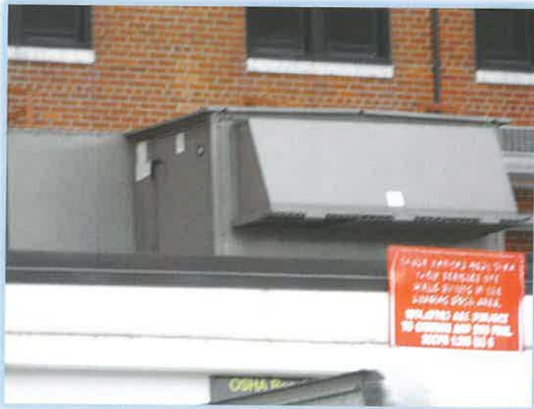
Building 1, Pharmacy Warehouse, York