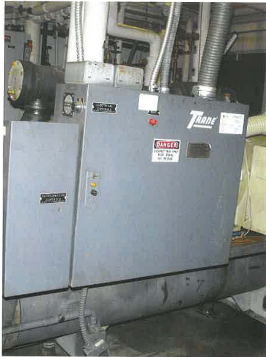
Building 24, Canteen, Trane 60 Ton