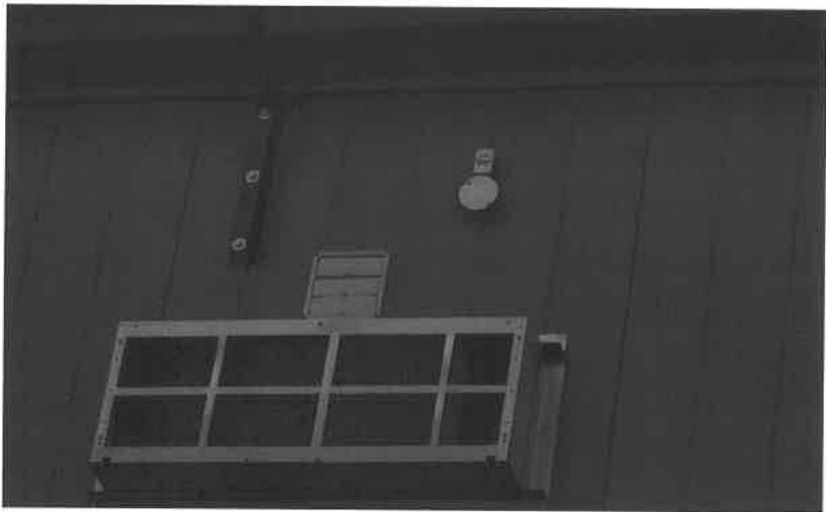
Building 23, Wall Unit