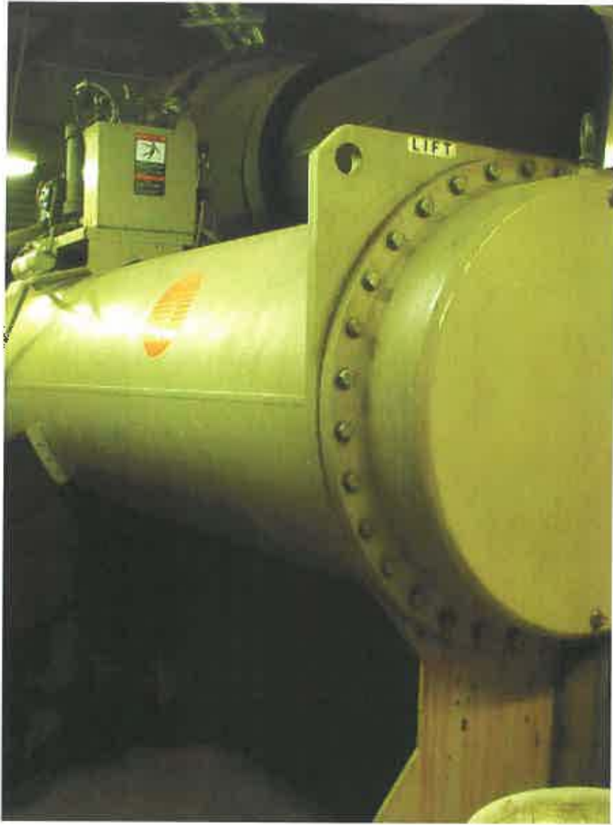
Building 1, Chiller Room, Trane 800 Ton