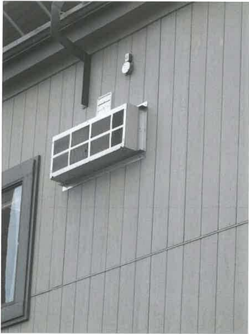
Building 23, Wall Unit