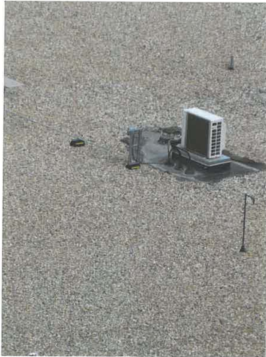
Building 24, Roof Unit