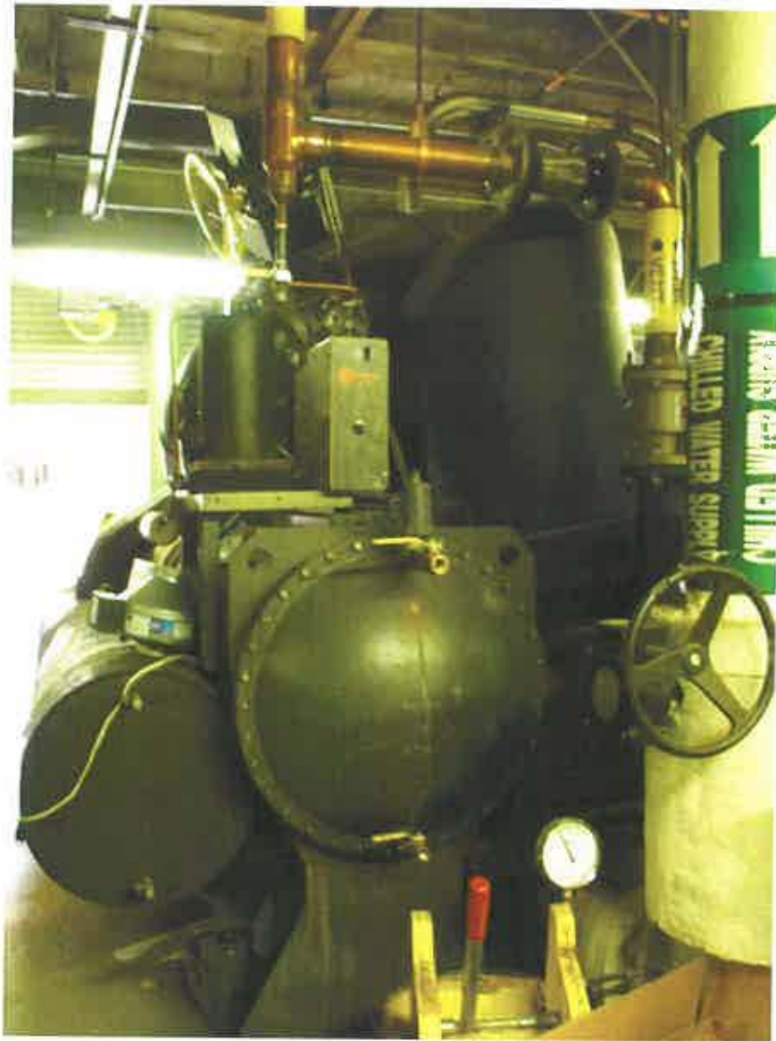
Building 1, Chiller Room, Trane 400 Ton