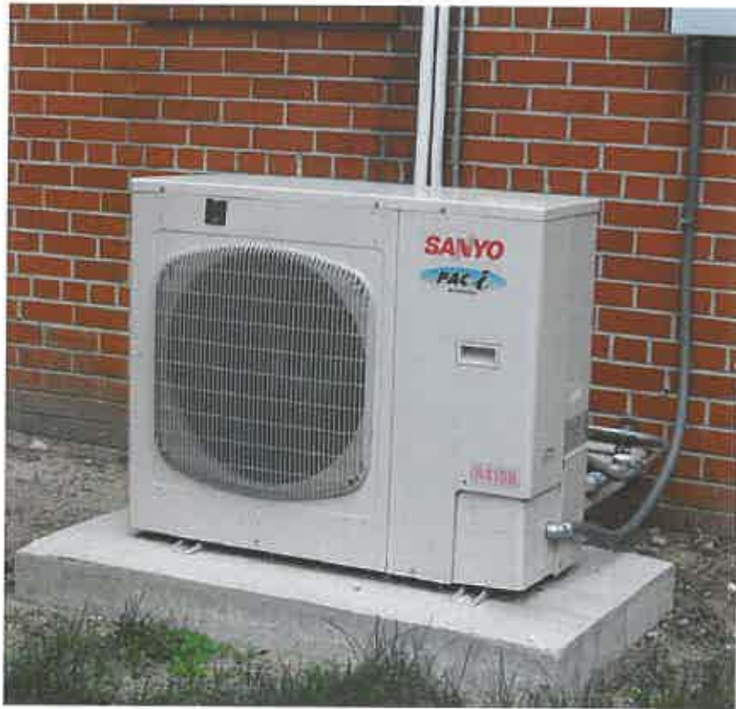
Building 21, Ground Unit, Sanyo