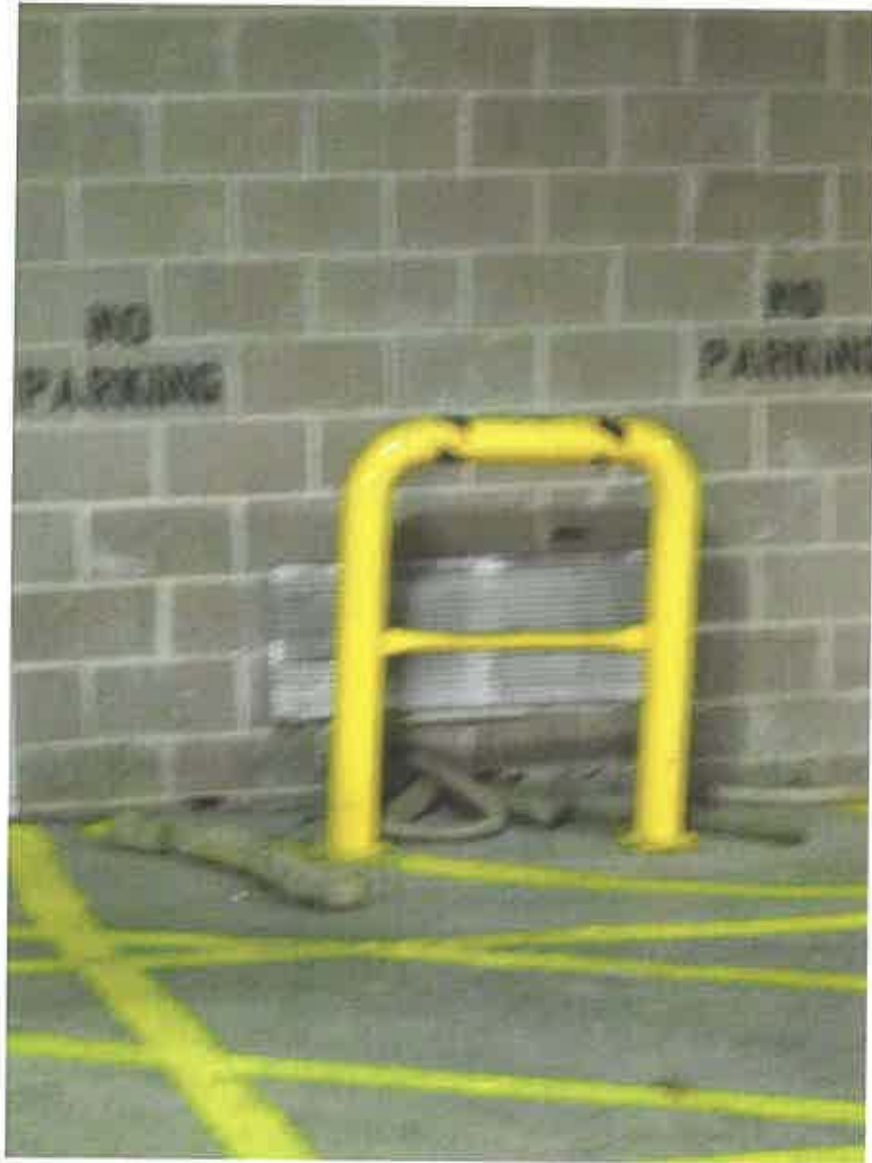
Parking Garage, Lower Parking Garage