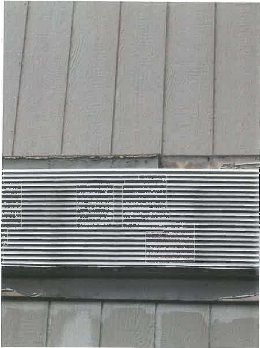
Building 23, Wall Unit