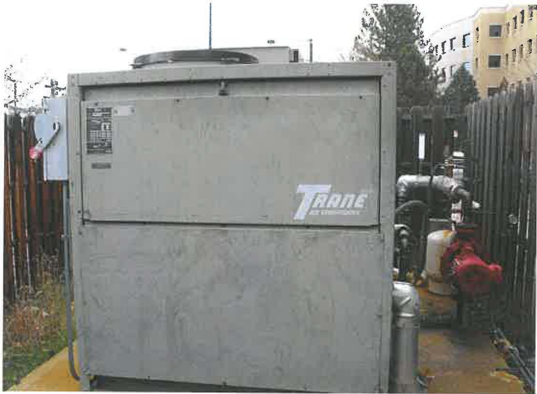
Building 4, Trane 40 Ton