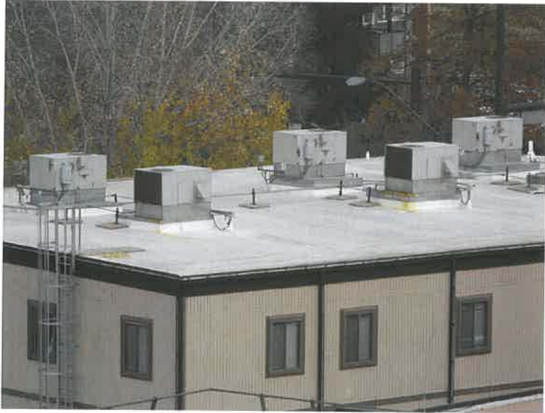
Building C, Trane 6 - 5 Ton Units