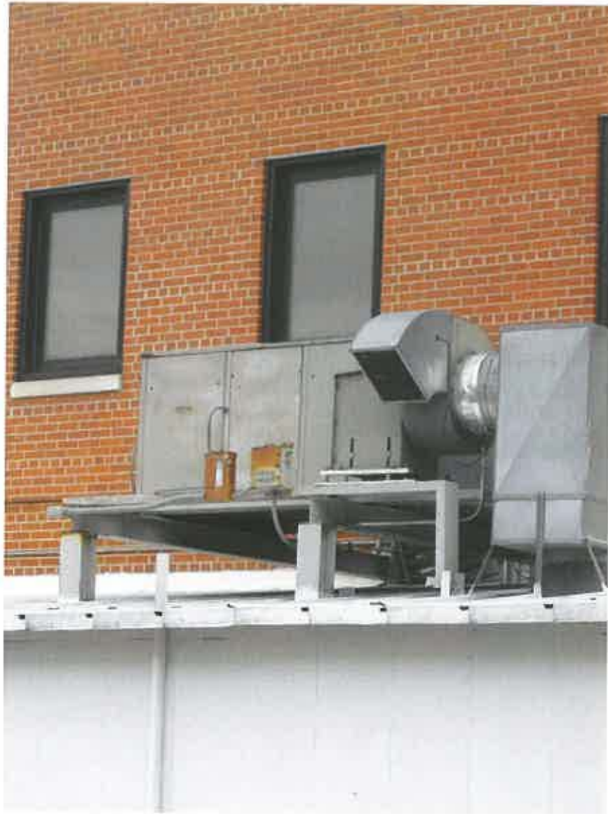
Building 19, Dog Run for Walk-In Freezer, Trane