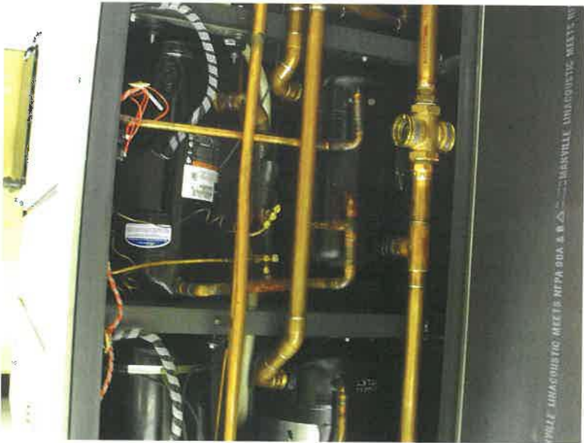
Building 1, IRMS , Datac 20 Ton