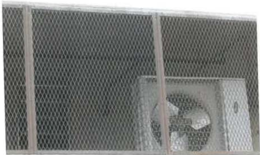
Parking Garage, Mechanical Room, Carrier