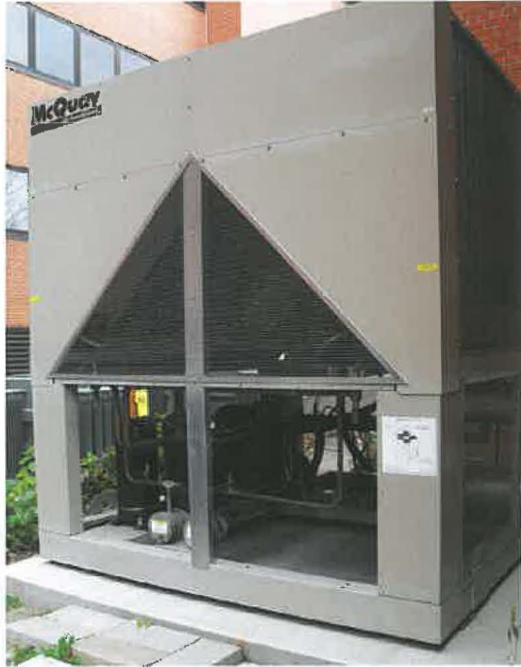
Building 21, For Animal Units, McQuay 30 Ton