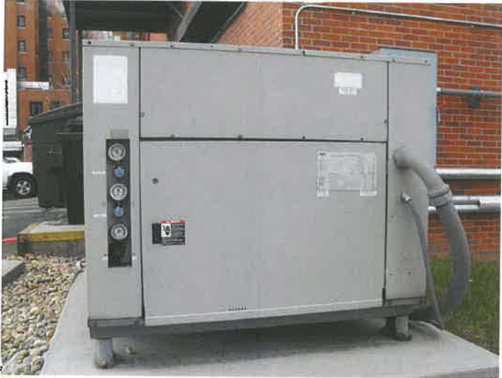
Building 24, Second Floor, McQuay 40 Ton