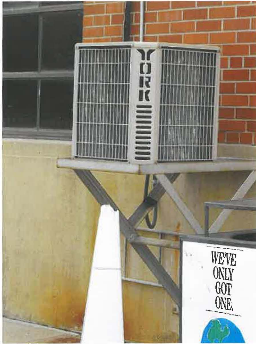
Building 8, York