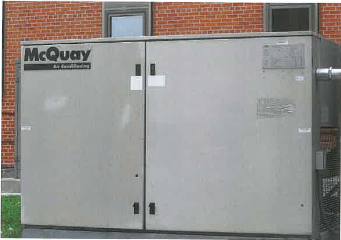
Building 19, 2nd and 3rd Floor, Basement, McQuay 50 Ton