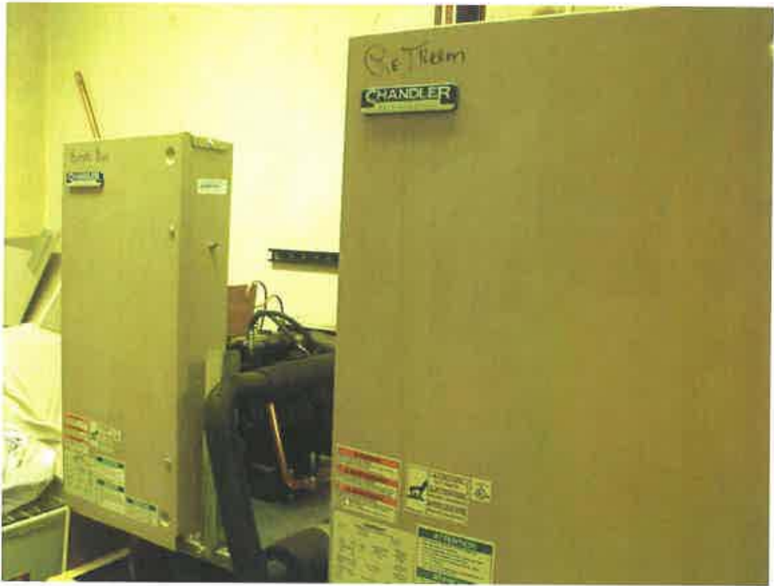
Building 1, BC-102 ReTherm and Entry Box, Chandlers