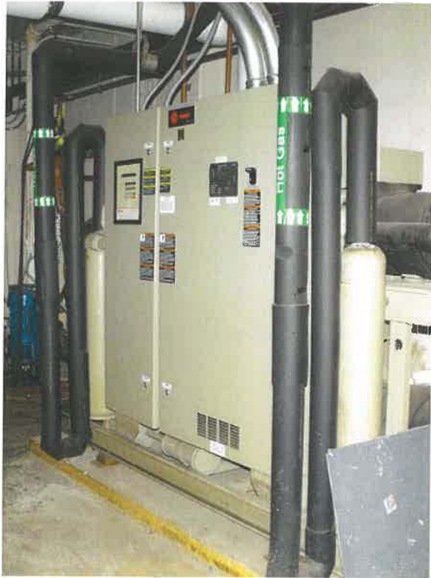
Building 21, 1st through 3rd Floors, Trane 90 Ton Split