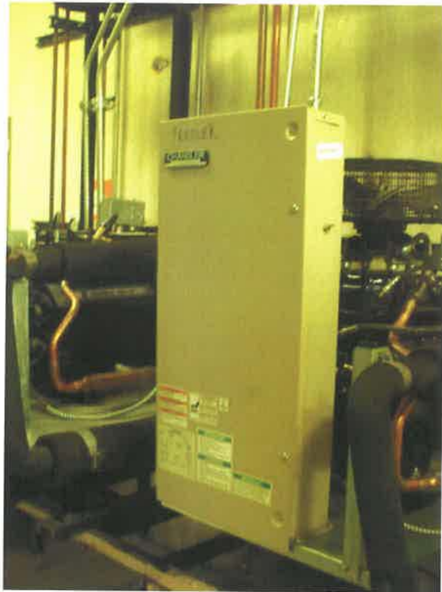
Building 1, BC-102 Freezer, Chandler