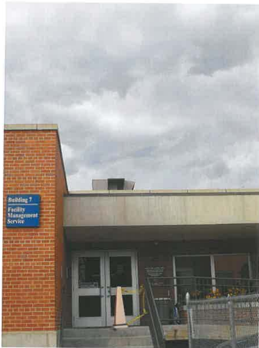
Building 7, FMS, Carrier