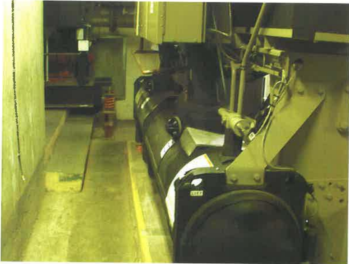
Building 1, Recip BA-126, Trane 60 Ton