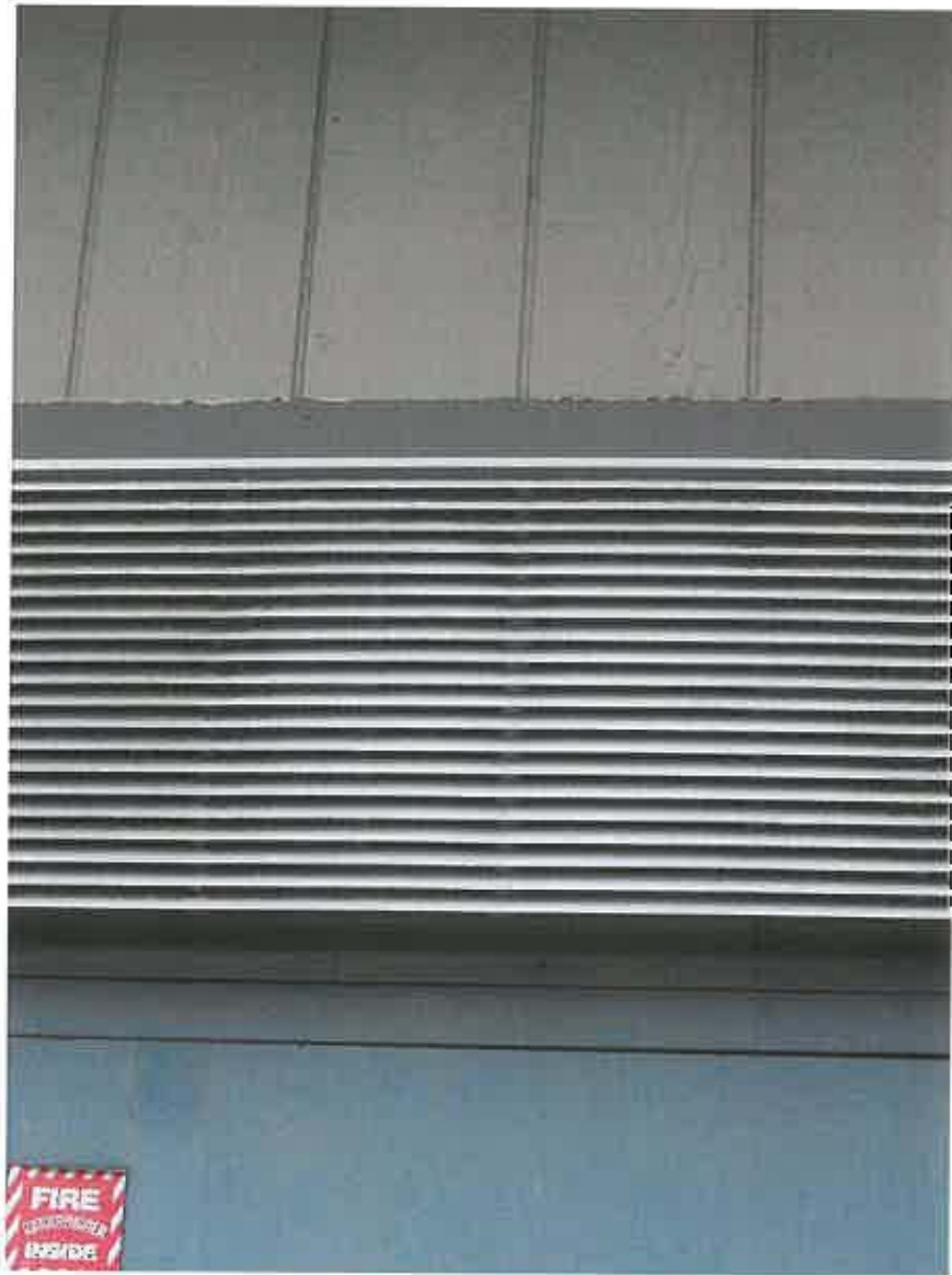
Building 23, Wall Unit