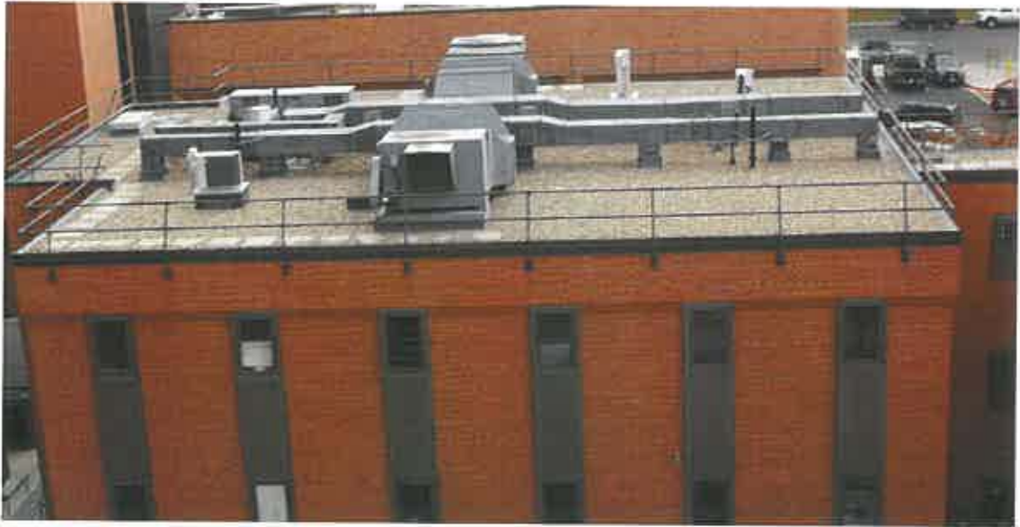
Building 21, Sanyo Roof Units (4)