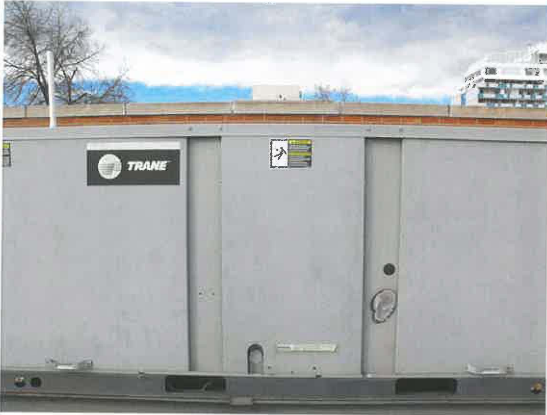
Building 7, Gym Trane