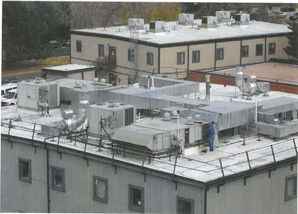
Building 23, North and South Units, Trane