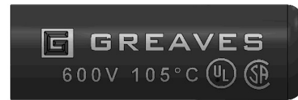
Table 1 – PT-FX Selection Guide