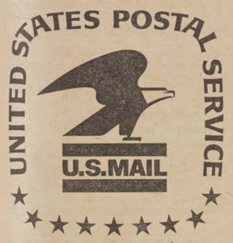
§ 119.4 Custody.

(b) The color representation of the seal shows a white field on which the eagle appears in dark blue, the words "U.S. Mail" in black, the bar above it in light red, the bar below in medium blue, and the border consisting of the words "United States Postal Service" and stars all in ochre.