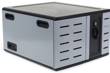
Zip12 Charging Desktop Cabinet