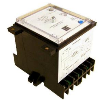
REGULATORY AGENCY APPROVALS