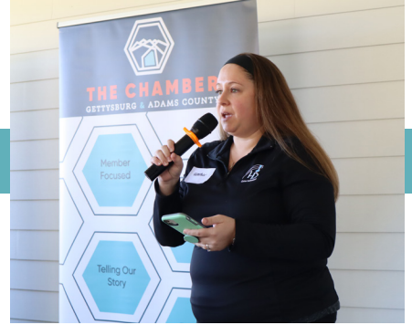
County Connections Luncheon October 10 Thirsty Farmer Brew Works