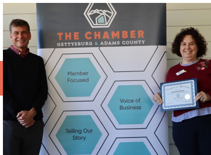
County Connections Luncheon October 10 AAA Central Penn, 30 years