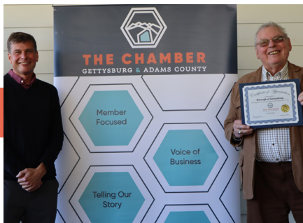
County Connections Luncheon October 10 Borough of Gettysburg, 20 years