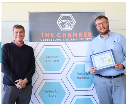
County Connections Luncheon October 10 Gettysburg Times, 30 years