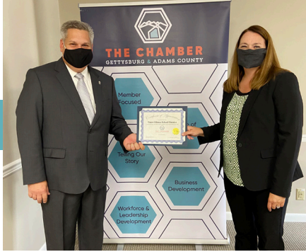
Member Anniversary Recognition Upper Adams School District, 30 years