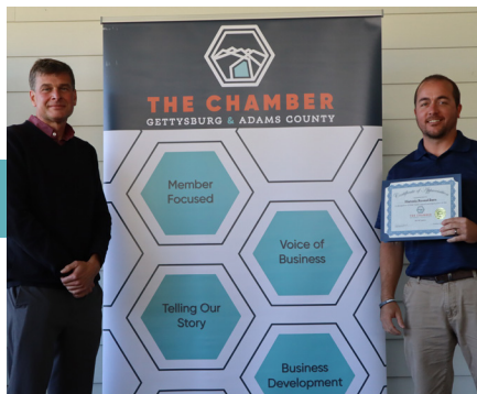
County Connections Luncheon October 10 Historic Round Barn & Farm Market 40 years