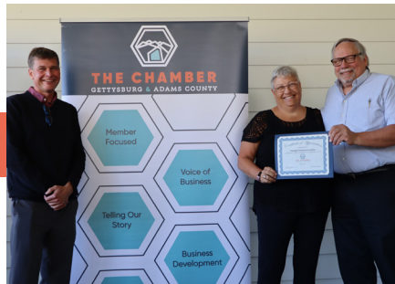
County Connections Luncheon October 10 Kanagy Communications, 1 year