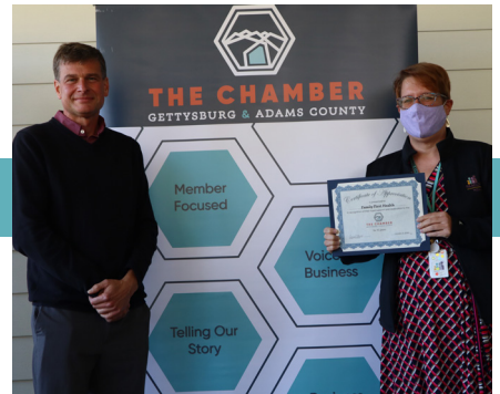
County Connections Luncheon October 10 Family First Health, 10 years