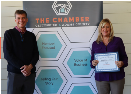
County Connections Luncheon October 10 Graphics Universal Inc., 1 year