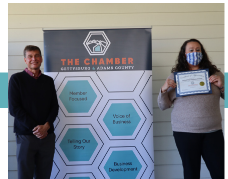
County Connections Luncheon October 10 United Way of Adams County 40 years