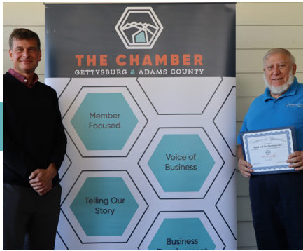
County Connections Luncheon October 10 Land and Sea Services, 15 years