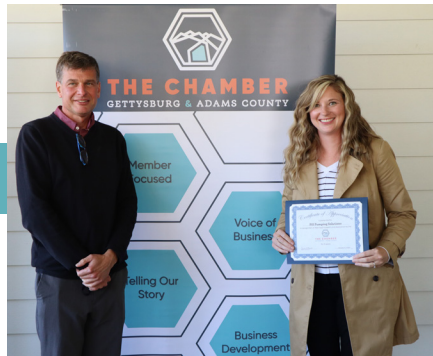
County Connections Luncheon October 10 PSI Pumping Solutions, 5 years