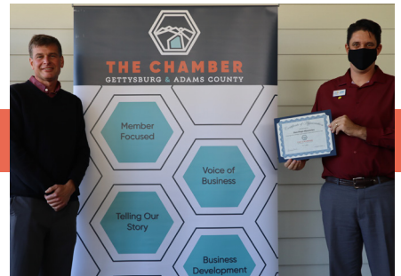
County Connections Luncheon October 10 New Hope Ministries, 1 year