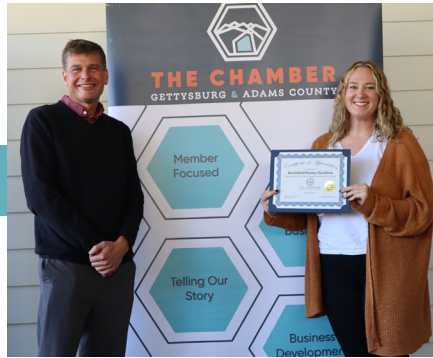
County Connections Luncheon October 10 Battlefield Harley-Davidson, 20 years