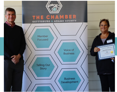
County Connections Luncheon October 10 Biggerstaff's Catering, 20 years