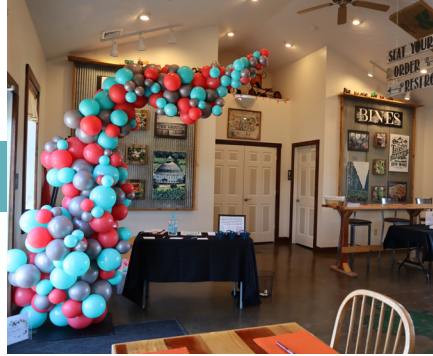
County Connections Luncheon October 10 Thirsty Farmer Brew Works