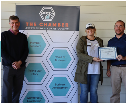
County Connections Luncheon October 10 Thirsty Farmer Brew Works, 1 year