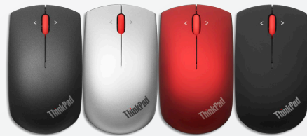
ThinkPad Precision Wireless Mouse - Midnight Black 0B47163, ThinkPad Precision Wireless Mouse - Heatwave Red 0B47165, ThinkPad Precision Wireless Mouse - Frost Silver 0B47167, ThinkPad Precision Wireless Mouse - Graphite Black 0B47168, ThinkPad Precision USB Mouse - Midnight Black 0B47153