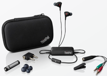
ThinkPad® Noise-Cancelling Earbuds (0B47313)