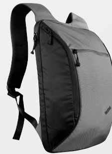
ThinkPad® Ultralight Backpack (0B47306)