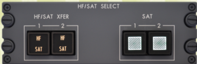
G7164-01 Dual SAT Channels shown