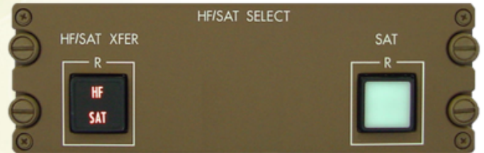
G7164-06 Single SAT Channel shown