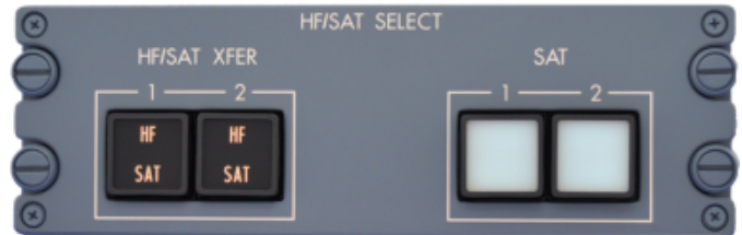
Airbus G7164-05 Dual SAT Channels shown