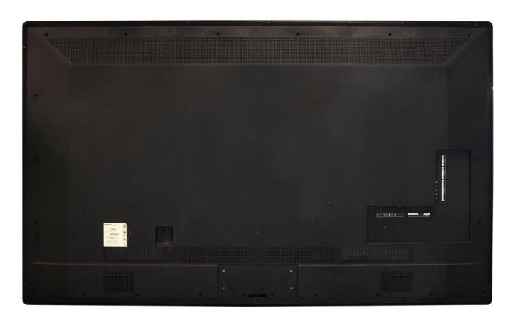
INF7001 back panel