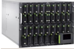
PRIMERGY BX900 S1

The PRIMERGY BX900 S1 is a rack unit that has an installed height of 10U and accommodates 1 to 18 server blades and 1 to 6 storage blades. The energy-efficient Intel Nehalem Quad-Core processors are used in the server blades. Ethernet, Fibre Channel and Infiniband networks are accessed via 8 switch bays. Switches from Cisco, Brocade and Emulex can be used. With its transfer rate of 6.4 Gb/s, the midplane used is the fastest on the market. 100V and 200V power supplies are available. This hardware platform is ideal for server consolidation and virtualization in the datacenter.