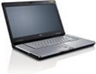
CELSIUS H Series

CELSIUS H Series. Powerful mobile workstation. If you run power-hungry 3D applications that demand no compromise on the graphics side, you'll appreciate the CELSIUS H. The system offers the power of a full-fledged workstation: Editing 3D OpenGL graphics in real time, running computer simulations and computing multimedia animations wherever you are.