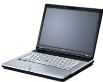
LIFEBOOK E Series

The LIFEBOOK S Series gives professional users the optimum combination of performance, modularity and flexibility: the functionality and ease of use of a desktop in a slimline, lightweight package. The integrated modem, network adapter, optional Bluetooth and wireless LAN are complemented by a multifunctional bay. The latest Intel Core 2Duo technology provide you long battery life away from the power socket.