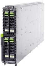
PRIMERGY SX940 S1

This storage blade for PRIMERGY BX600 offers an easy and cost effective opportunity for server consolidation. Rack and tower servers with high capacity of local hard disks are operating primarily in the area of small and medium enterprises. Very often it is essential having local access on large amounts of data; this for example applies to the wide area of Computer Aided Engineering (CAE), where smaller workgroups locally have to work on and create very large models. Operation within confined environments as file servers as well as for Microsoft SharePoint Servers and Microsoft SQL Servers are popular usage cases.