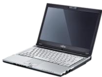
LIFEBOOK S Series

The Fujitsu LIFEBOOK T901 is an ultra versatile lightweight convertible notebook for the professional user. Its brilliant, bi-directional rotatable, high-bright LED display including LED rotation indicators is a pleasure to use. With the LIFEBOOK T901 you can either work with multiple finger-touch or with the multifunctional pen. Berliner Glass ensures highest reliability.