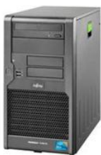
PRIMERGY TX100 S1

Always something new in the Peripherals Portfolio: e.g. keyboards and wireless sets in glossy piano black design fitting perfectly to the new lifestyle displays. Accessories and Security Devices according to latest technologies meet the latest market needs.