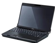
LIFEBOOK P Series

Take advantage of the growing network of wireless working and catch up emails where ever you are via optional embedded UMTS.