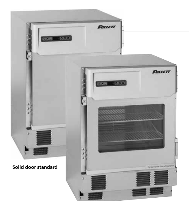
Optional glass door