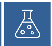
Wear Metals in Oil