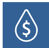
Poor Fuel Efficiency