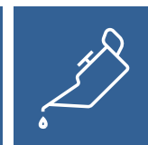
High Oil Consumption