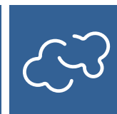
Blue or White Smoke