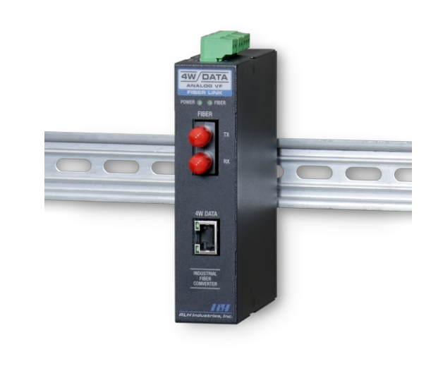
4 Wire Data with E&M DIN Fiber Link

This system transports one circuit of 4 Wire Data and supports E&M signaling. The devices can be ordered with dual fiber or single fiber transceivers. The 4 wire data supports constant transmission of voice frequency ranging from 300Hz-3,400Hz which is suitable for a wide range of radio and SCADA applications. This RLH Fiber Link system is designed and made in the U.S.A. and covered by our Limited Lifetime Warranty .