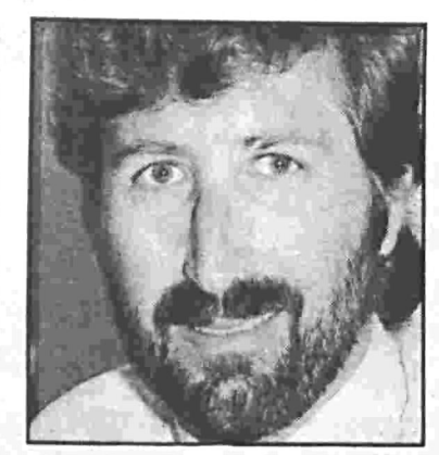
Exploring the Northwest