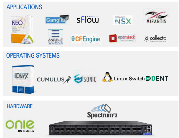
Figure 1. Open Ethernet Operating System and Hardware

With a range of system form factors, and a rich software ecosystem, SN4000 series allows you to pick and choose the right components for your data center.