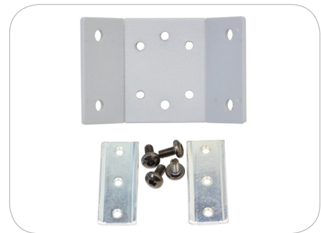
Interface Bracket Kit 60-587-207