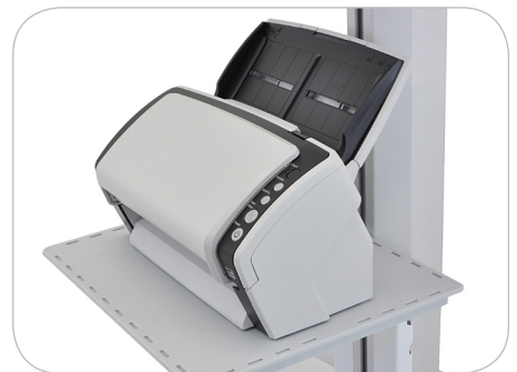
SV4X cart with scanner/printer placed on Ergotron's Large Utility Shelf 97-540-053 and attached with the T-Slot Bracket 60-575-003

© 2011 Ergotron, Inc. rev. 10/04/2011 Content is subject to change without notification