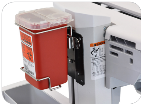
SV cart with small Sharps container and wall mount bracket attached via Ergotron's VESA Mount Kit 97-512-009