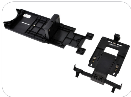
Universal Tablet Cradle 80-106-085