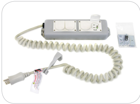
Medical-Grade Power Strip 97-466-214 (Available North America)