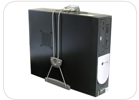
Universal CPU Holder 80-105-064