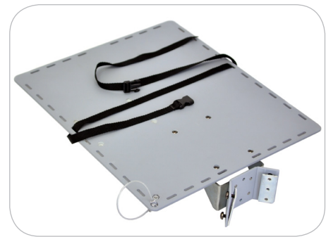
Large Utility Shelf 97-540-053