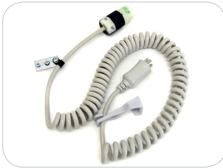
Coiled Extension Cord Accessory Kit 97-464 (Available North America)