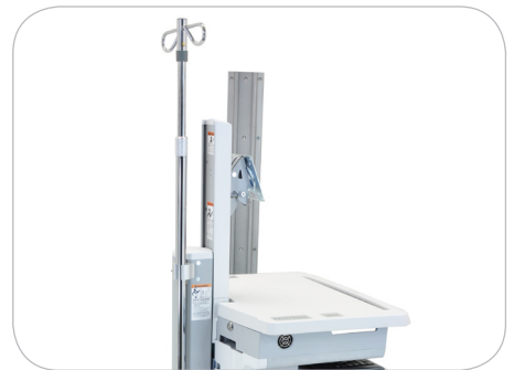
SV cart with IV Pole attached via Ergotron's StyleView IV Pole Clamp Kit