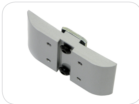
T-Slot Bracket 60-575-003