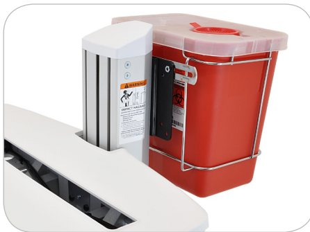
SV cart with large Sharps container (5 quart) and wall mount bracket attached via Ergotron's VESA Mount Kit 97-512-009