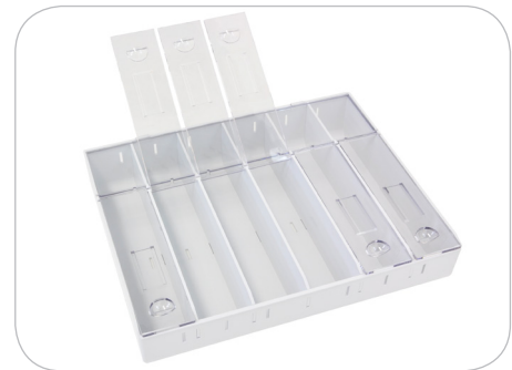
Coming Soon! StyleView Medical Drawer Tray Accessory