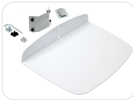
Utility Shelf 97-507-216