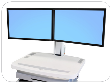
SV Dual Display Kit 97-574