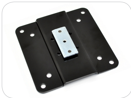
SV Rear VESA Mount Kit 97-512-009