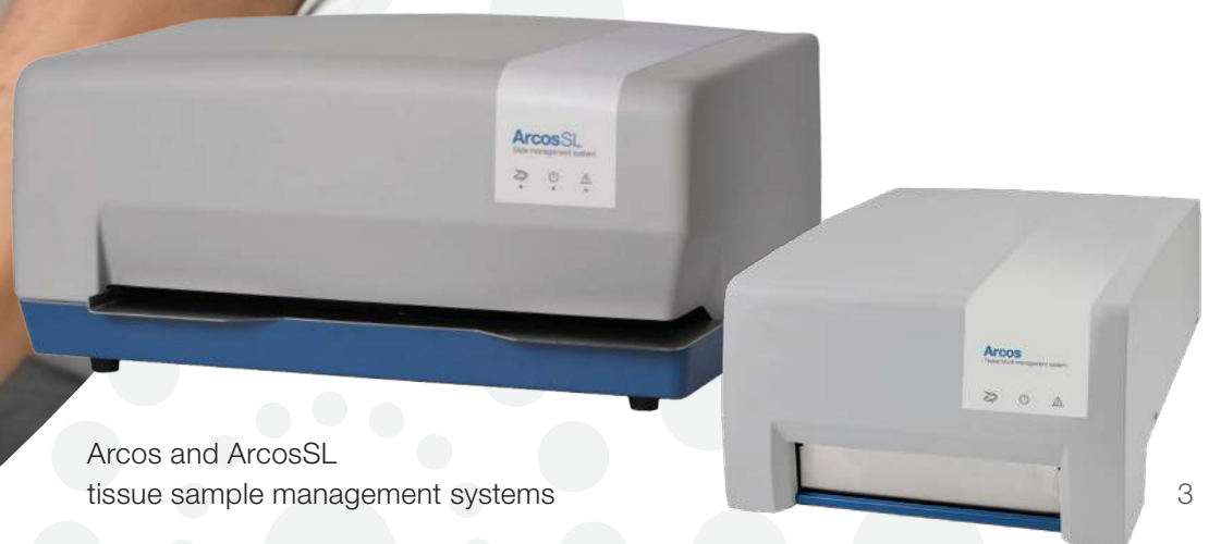
Arcos and ArcosSL tissue sample management systems

Let us help you minimize errors, increase productivity and keep your laboratory's resources focused on what matters most – positive patient outcomes.