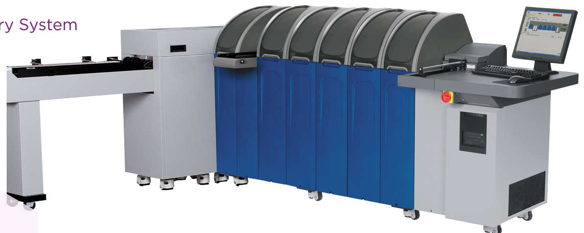
MXD210 Card Delivery System

Print-on-demand: Leverage black and white printing inline, feeding pre-printed sheets into the system.