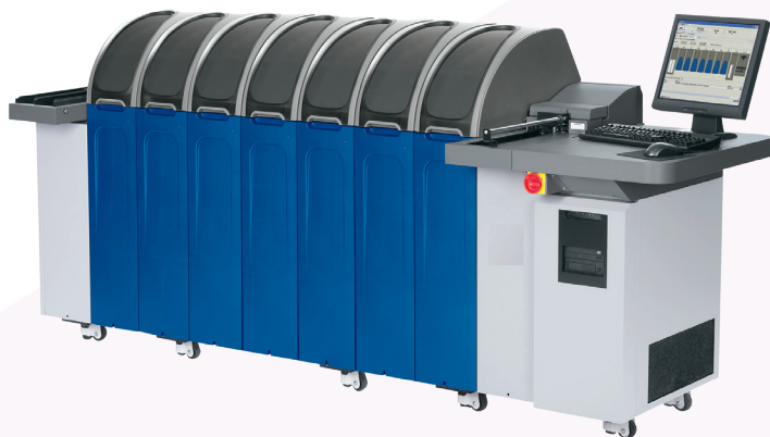
MX2100 Card Issuance System

Service and support: The MX Series Platform is supported by the industry's largest service and support network, which spans more than 150 countries worldwide. Online and phone support is available 24/7.