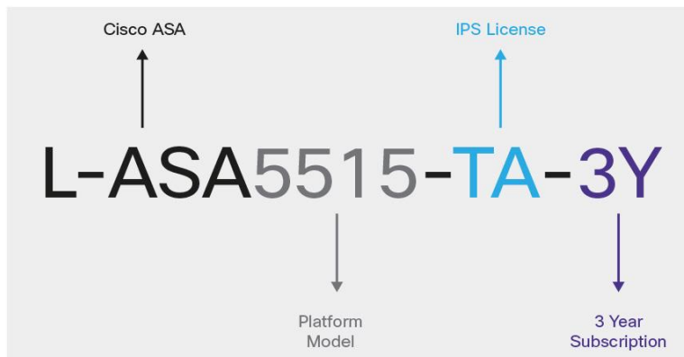
Figure 2. Example SKU: Cisco ASA with FirePOWER Services License for IPS and Apps (NGFW) for a 3-Year Term

When customers order a subscription, they receive an activation key unique to that product. They use this key to generate a license to install the FirePOWER Services feature license on the appropriate virtual or physical Management Center appliance. Management Center controls and manages FirePOWER Services or Threat Defense software licenses and feature subscriptions.