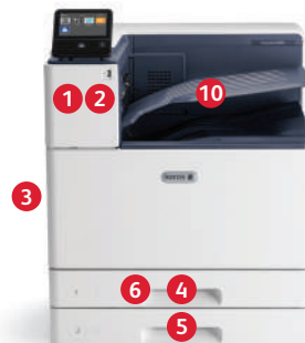
Xerox® VersaLink® C8000 and C9000 Default Configuration