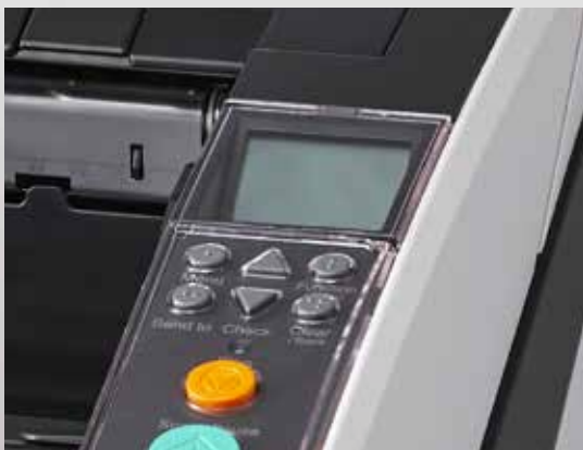
Integrated LCD operating panel

Fujitsu’s fi-7800 and fi-7900 deliver the complete scanning solution. A combination of our market-leading scanner, software and service give you everything needed for a more productive system and more productive people, allowing you to focus more on your business and less on your technology.