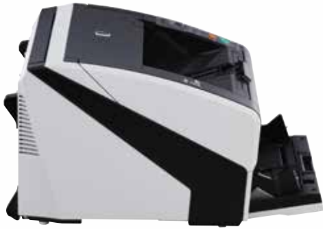
fi-7800 – A4 Landscape at 300 dpi 110 ppm / 220 ipm fi-7900 – A4 Landscape at 300 dpi 140 ppm / 280 ipm Scan mixed batches through the 500 sheet ADF