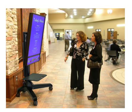
Neo-Flex Mobile MediaCenter: rotate your screen for portrait/landscape viewing.