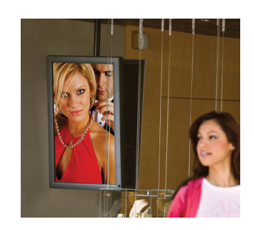
Professional grade ceiling mounts provide single and back-to-back flat panel mounting options. With versatility and flexibility built right in, these mounts are ideal for any ceiling application – whether TV viewing or digital signage.