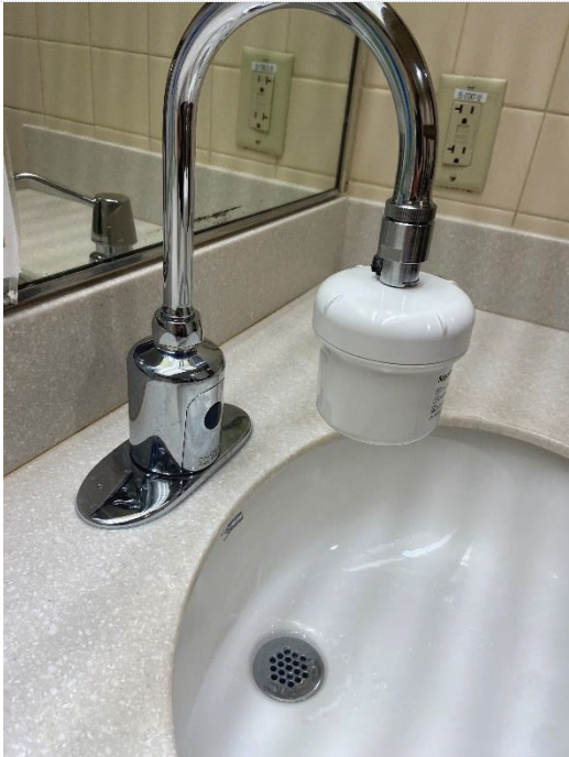
Photo #9: Women's RR 24 – POU filter installed (6.2.23) on fixtures in addition to In-line filter (4.21.23)