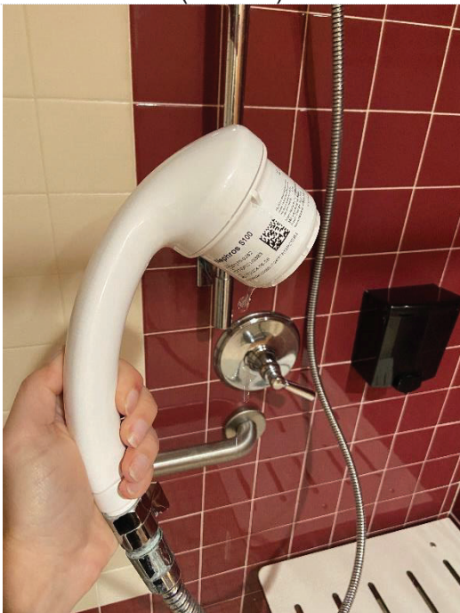
Photo #11: 1 st Floor – Women's Shower – POU filter installed 4.21.23