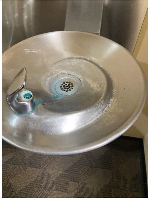
Photo #2: Evidence of scale on drinking fountain bubbler (Level 3)