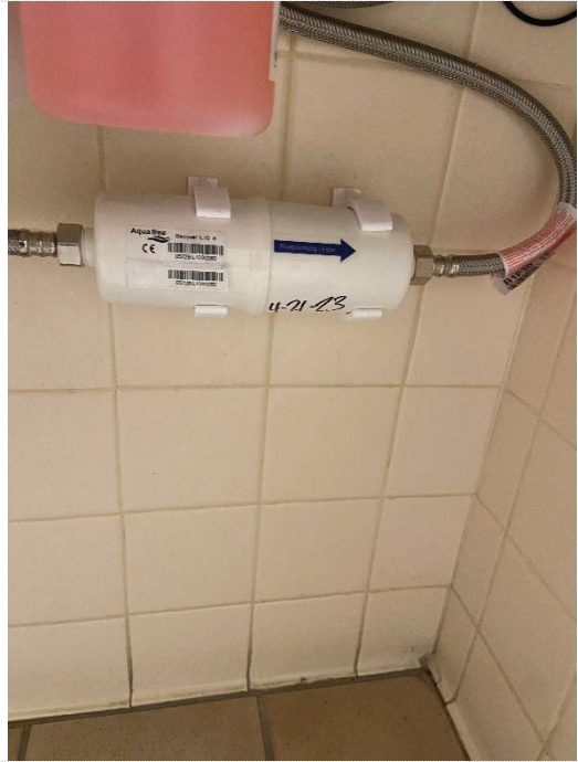
Photo #6: In-Line filters installed 4.21.23 for sensor sinks in restrooms