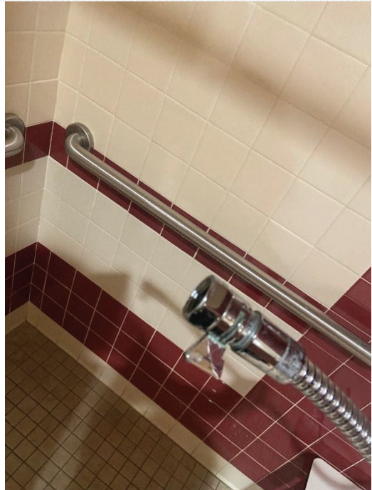
Photo #10: 1 st Floor – Women's Shower – POU Filter removed for sampling