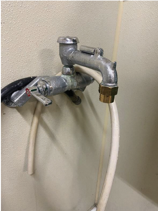
Photo #7: Janitor Closet Mop Sink – POU filter removed for sampling