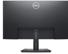
Back view - Cable management

Easily adjust the panel to your preferred viewing position.