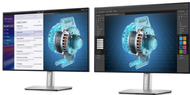
Dell UltraSharp USB-C Hub Monitor - U2421E

Experience vibrant color and reduced harmful blue light emissions with ComfortView Plus. Featuring an RJ45 port for Ethernet connectivity.