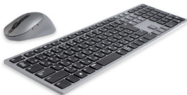
Dell Premier Multi-Device Wireless Keyboard and Mouse - KM7321W

Work from anywhere with this Bluetooth Teams certified headset that lets you switch seamlessly to your PC or smartphone and enjoy crystal clear audio on the go.