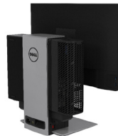
Dell Small Form Factor All-in-One Stand - OSS21

Experience vibrant color and reduced harmful blue light emissions with ComfortView Plus. Featuring an RJ45 port for Ethernet connectivity.