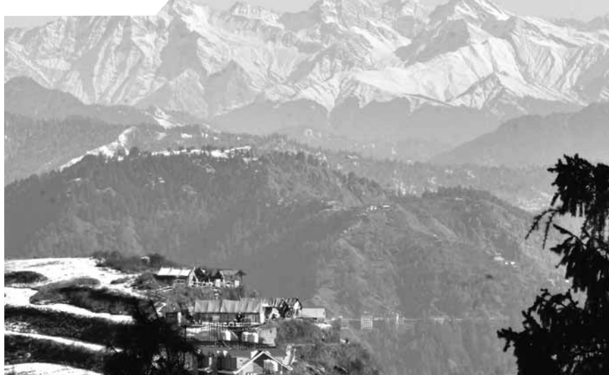
A view of the snow-covered Himalayan range, in Shimla