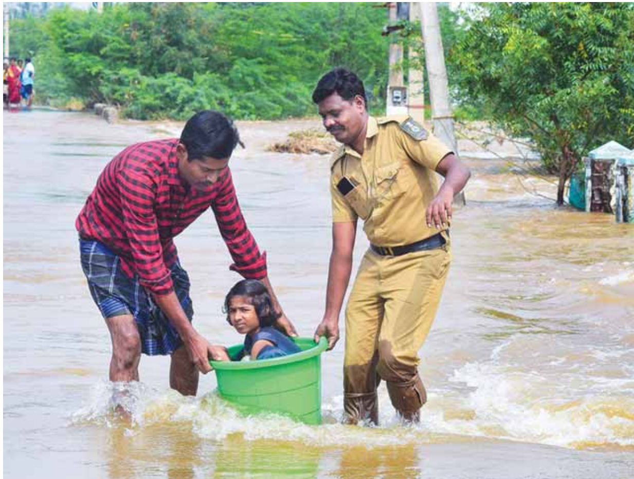
A child sitting in a bucket being evacuated by a man and a policeman from a flooded area of Verma Nagar due to the overflowing Ariyar river following heavy rain, in Trichy district on Tuesday

UP: 3 KIDS BURNT TO DEATH DURING SLEEP Mirzapur: Two sisters and a brother, aged three to seven-years, were burnt to death at Pachokhara Khurd village in Madihan area of the district here, police said. The children were sleeping on a pile of straw in the barn on Monday evening when it caught fire, police said.