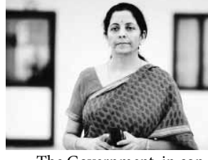
The Government, in consultation with Central Vigilance Commission, has recently finalised a consolidated Staff Accountability Framework for non-performing assets (NPAs) accounts up to ₹50 crore, other than fraud cases, she said.

New Delhi: The Government has taken various measures to protect bona fide commercial decisions of banks to alleviate the fear of any unwarranted hardships to officials or senior executives taking key decisions.