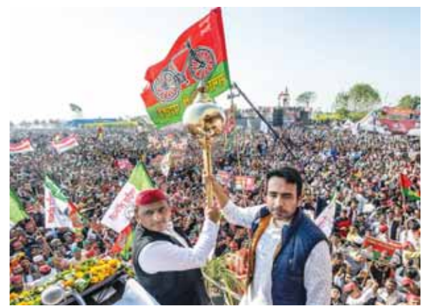
Samajwadi Party chief Akhilesh Yadav with RLD leader Jayant Choudhary during a SP-RLD rally in Meerut on Tuesday

Addressing the gathering, Akhilesh said if the alliance comes to power after next year elections, the first work will be to build a memorial for "martyrs" of the farmers' protest. He attacked the ruling BJP saying the "2022 election will see the eclipse of the BJP from western UP, as the ruling party has practiced the