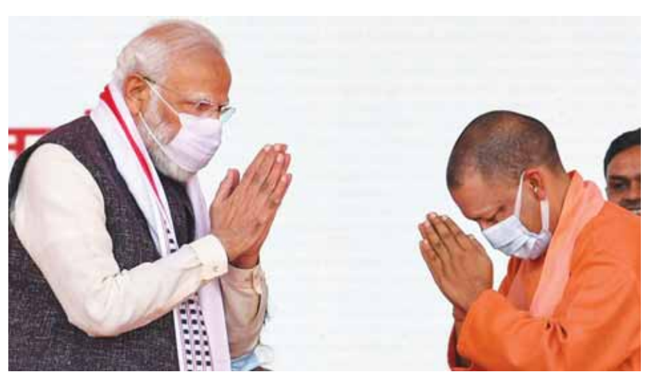
Prime Minister Narendra Modi and Uttar Pradesh CM Yogi Adityanath at the launch of various development projects, in Gorakhpur on Tuesday

Questioning the ideological commitment of BJP's political rivals, Modi said "lal topiwalas" discarded the ideologies of Ram Manohar Lohia and Jai Prakash Narayan long