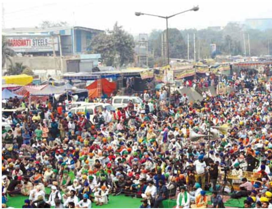
Farmers gather in large numbers at Singhu Border during their Delhi Chalo protest march against the Centre's new farm laws in New Delhi on Friday

According to BJP leaders, their "awareness campaign" (on the farm laws) which got thwarted on account of coronavirus pandemic, would be expanded and also involve