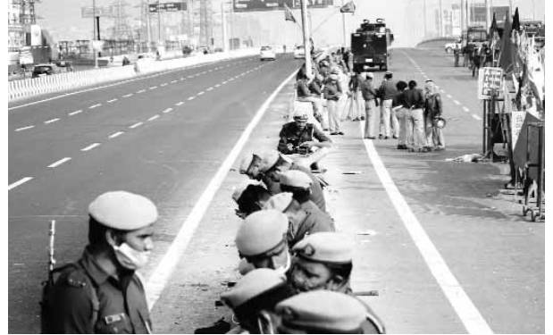
Divisional Magistrate (SDM) Gurugram, Badshahpur, Pataudi and Sohna will be in charge in their respective areas.

has been appointed as overall in-charge for the entire district in case of blocking the highway. Apart from this, Sub