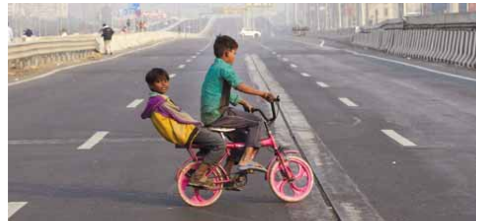
Children ride a bicycle on Delhi-Meerut Expressway during farmers' Delhi Chalo protest against new farm laws at UP side of the Ghazipur Border of New Delhi on Friday

Alternative routes to/from Haryana, UP witness traffic chaos in national Capital