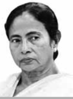
West Bengal CM —Mamata Banerjee

They are alleging lawlessness in Bengal. I want to ask whether you are unable to go out in the streets.