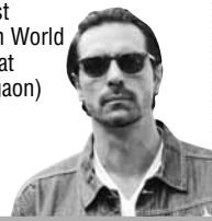
Actor —Arjun Rampal

If we say the Holocaust happened with Jews in World War II, I don't think that (battle of Bhima Koregaon) was anything less.