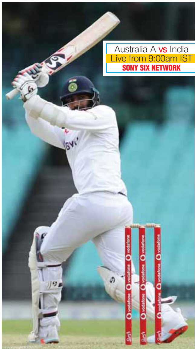
Jasprit Bumrah plays shot during his unbeaten 55-run innings against Australia A on first day of pink ball warm-up game at Sydney Cricket Ground on Friday.

Earlier, after skipper Ajinkya Rahane opted to bat, Prithvi Shaw (40) and Shubman Gill (43) — both 21-year-old batsmen with bright futures — showed enough