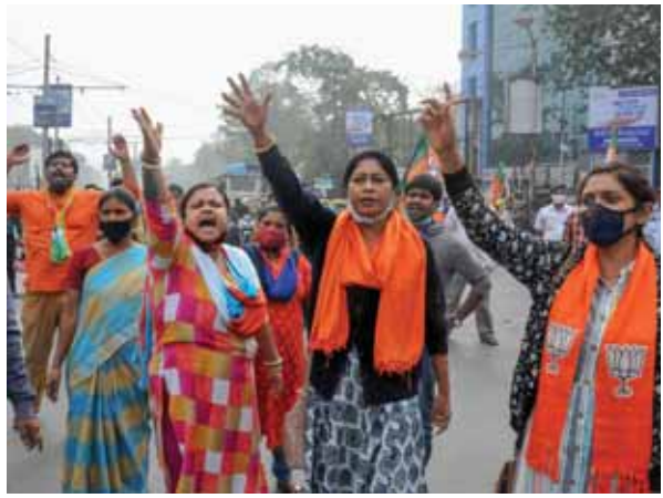
BJP workers block a road during a protest against the attack on party national president JP Nadda's convoy in West Bengal, in Kolkata on Friday