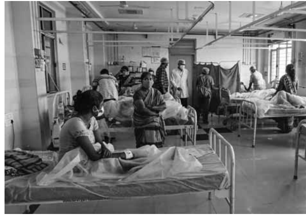
Andhra Pradesh Health Minister Alla Kalia Krishna Srinivas (Alla Nani) meet patients, who fell ill suspectedly due to water contamination in Eluru town, at a hospital in Vijayawada, on Thursday

"Will anybody do these things when a person like me asks? This problem has occurred because of municipal water," he complained.