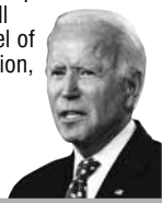
US President-elect —Joe Biden

This distinguished group of public servants will bring the highest level of experience, compassion, and integrity to bear.