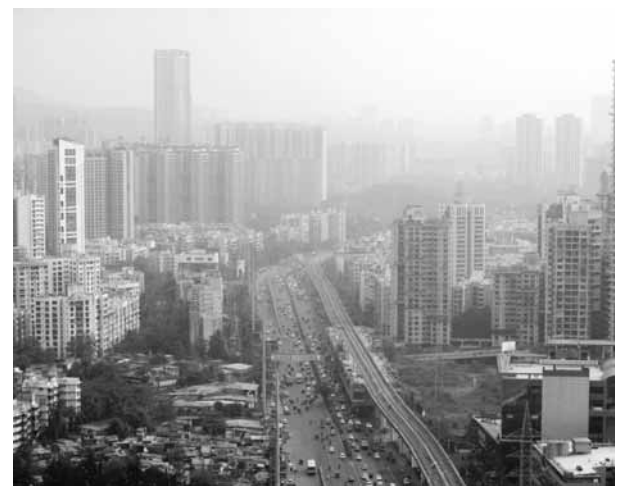
Smog engulfs the highrise buildings in Mumbai on Friday

Even after the directives of the administration, Corona infected patients are putting in isolation into the city, not only that the data of these patients are not being recorded, even the administrative officer is completely unaware about this. PNS