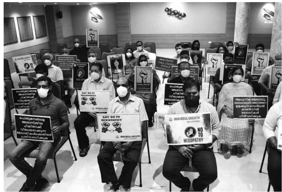
Doctors of Indian Medical Association (IMA) hold placards during a protest, demanding the withdrawal of CCIM notification, at IMA House in Kochi, on Friday

He said police later established that both were adults and belonged to the same faith. The two eloped 13 days ago from Azamgarh and the woman's family had lodged a missing person's report at the police station, he said.