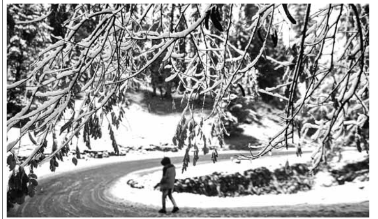
A vehicle moves on a snow-covered road during seasons first snowfall at Gulmarg in Baramulla on Wednesday