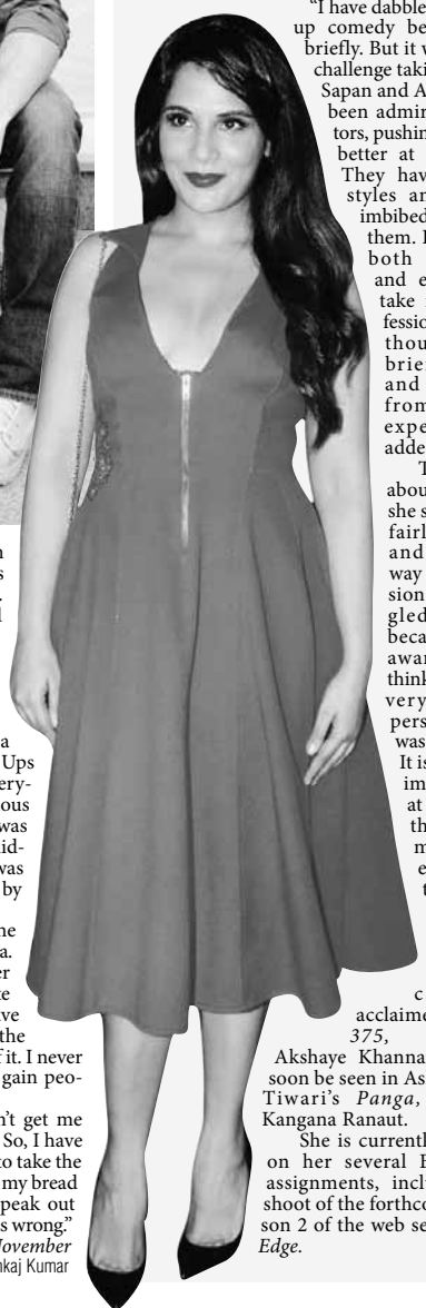
(The film releases on November 15.)

She is currently working on her several Bollywood assignments, including the shoot of the forthcoming season 2 of the web series Inside Edge .