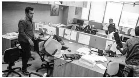
Shiv Sena party workers vandalise insurance company IFFCO Tokios office in Pune on Wednesday

Sena activists, who were carrying saffron flags with them, went on a rampage inside the insurance company's office, by smashing the window panes glass dividers, destroying the office furniture and cabins.