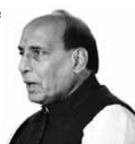
Defence Minister — Rajnath Singh

India is ready to explore opportunities and co-production of high-end defence equipment with Russia.