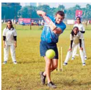
Adam Gilchrist spends time playing cricket with local girls

Australia cricket legend Adam Gilchrist on Wednesday said T20 cricket is a bit of lottery but pinned India as one of the favourites to lift the format's ICC World Cup in his country next year. Besides India, Gilchrist picked