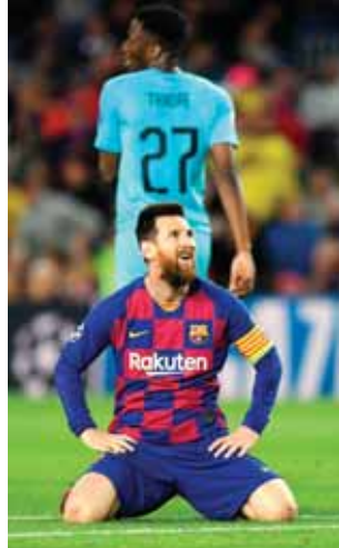
AFP ■ LONDON/DORTMUND

Chelsea hold Ajax for 4-4 draw after trailing 1-4 on 55th minutes; Hakimi's second half double caps Dortmund's 3-2 win against Inter; Barca stumble