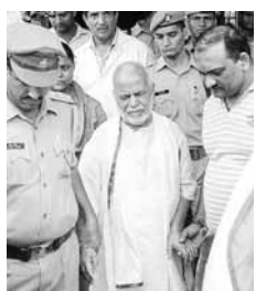
sheet was filed.

Chinmayanand, the law student, and some others were also brought to the court on Wednesday after the charge