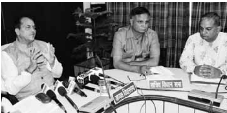
PNS ■ DEHRADUN

79th convention of presiding officers would be held from December 17 to 21 in the provisional State Capital