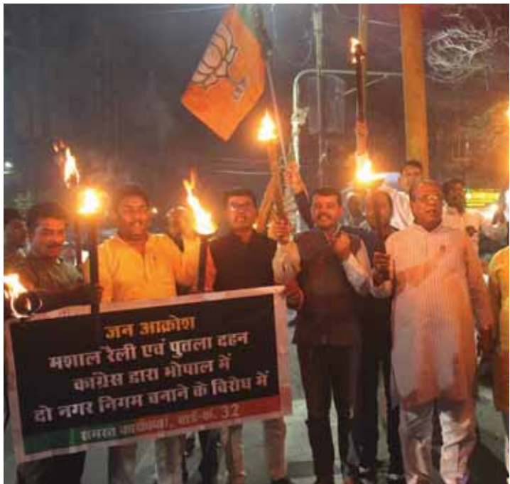
BJP activists hold torches as they protest against the State Government's decision over bifurcation of Municipal Corporation, in Bhopal on Wednesday.

Arjun Platoon won the coveted GOC-in-C ARTRAC Banner for standing First amongst the four Platoons. These Gentlemen Cadets will now proceed to Officer Training Academy, Gaya for Passing Out Parade before getting commissioned as officers in Indian Army on December 07, 2019.