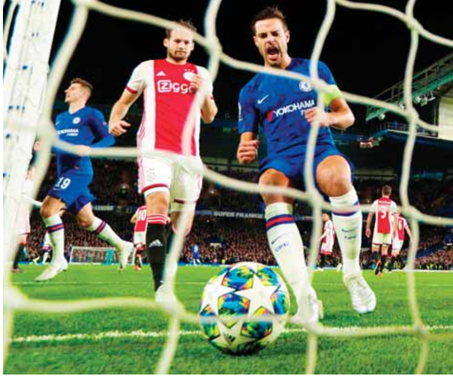
Cesar Azpilicueta celebrates after scoring Chelsea's second goal against AFC Ajax Amsterdam during UEFA Champions League match at Stamford Bridge

Teenager Reece James made it 4-4, and Chelsea thought they had gone in front when Azpilicueta fired in, but that goal was disallowed for an Abraham handball.