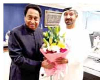
Madhya Pradesh Chief Minister Kamal Nath meets Chairman and CEO of Emirates Airlines, Sheikh Ahmed bin Saeed Al Maqtoom, at the airline's headquarters, in Dubai on Wednesday