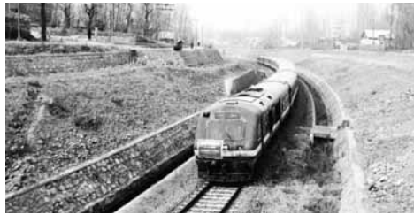
Srinagar, Chief Controller, Northern Railways, Senior Divisional Mechanical Engineer, Northern railways and other concerned officials.

A high-level review meeting was attended by IGP Kashmir zone, SSP Srinagar, SSP Railways, Additional Commissioner, Kashmir, ADC