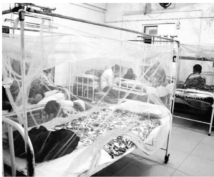
In view of the Dengue outbreak, the Government JP Hospital administration provided mosquito mesh to the patients in Bhopal on Wednesday