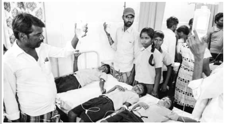
Children from a Government primary school being treated at a hospital as they fall ill after consuming mid-day meal at their institution in Chitradurga district on Wednesday