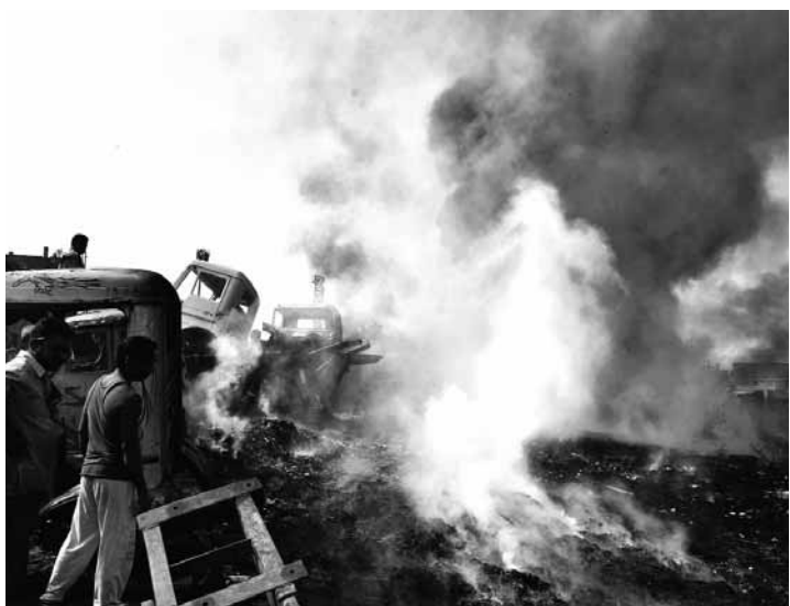
A massive fire broke out in a scrapyard in old city locality in Bhopal on Wednesday

"Our priority is more on quality publishers and not just quantity. We would like book lovers to come and enjoy books to cultivate a reading habit," said the secretary of Tagore Society. In view of the demands of the students, this time in fair textbooks and recommended books will also be available apart from regular books.