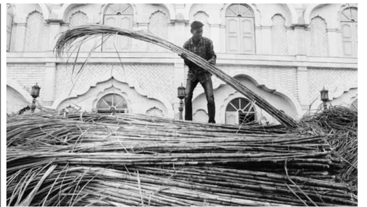
A vendor arranges sugarcane for sale in the market ahead of Devuthani Gyaras in Bhopal on Wednesday

It is pertinent to mention here that in the past, senior officials of Uttarakhand State Transport Authority have also appealed to the general public to obey by the traffic laws rather than bickering about high amount of penalty.