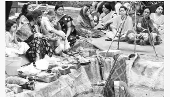
SPANDAN, a society aware of curatorial and protection of cultural treasure trove of the country has been organising Chhath for the last four years in Kancharjunga apartments in Noida. This year's celebration is the fifth in the series. The essence of Chhath celebration may be manifested in paying obeisance to the sun, the master of human life. In the celebrations under the aegis of SPANDAN around 200 people participated. They were not only from the Kancharjunga apartment but also from other neighbouring apartments. At the end of the celebration the people were exposed to the aim and purpose of the festival and they were all vowed to maintain cleanliness and the air quality in their daily lives.