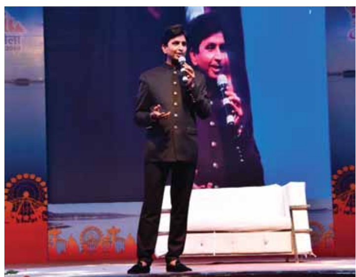
Noted poet Kumar Vishwas recites his verses at the inauguration of Taal Mahotsava Mela-2019 in Bhopal on Wednesday

The PM10 concentration was 226 ug/m 3 at 1.30 pm. The safe levels of PM2.5 and PM10 are 60 ug/m 3 and 100 ug/m 3 , respectively.