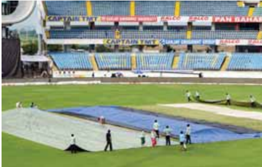
Indian workers cover the pitch on the eve of second T20