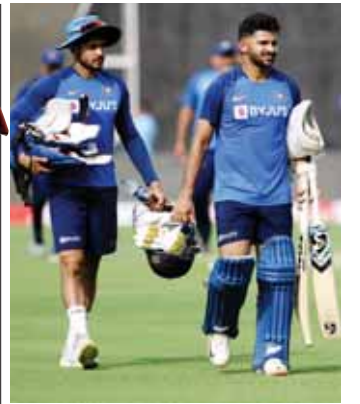
Indian pacer Shardul Thakur, right and Manish Pandey return after a practice session ahead of their second Twenty20I against Bangladesh in Rajkot

India vs Bangladesh Live from 7:00pm IST STAR SPORTS 1 NETWORK