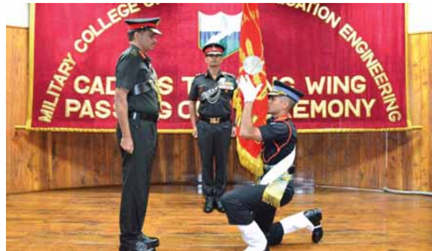
congratulated the Passing Out Course on successfully completing the training and reminded them of what the nation expects from them, especially in view of the rapid technological advancements, prevailing counter