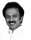
DMK president — MK Stalin

Whether in public space or in courts, it is for the accuser to prove his charge that our Murali office is on land allotted to Dalits.