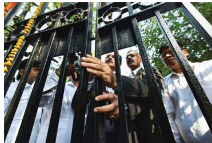
Lawyers place a lock on the gate of Patiala Court during a protest in New Delhi on Wednesday

Police said they did not receive any PCR call in connection with the two incidents at the Rohini court. The lawyers raised slogans while litigants were standing outside