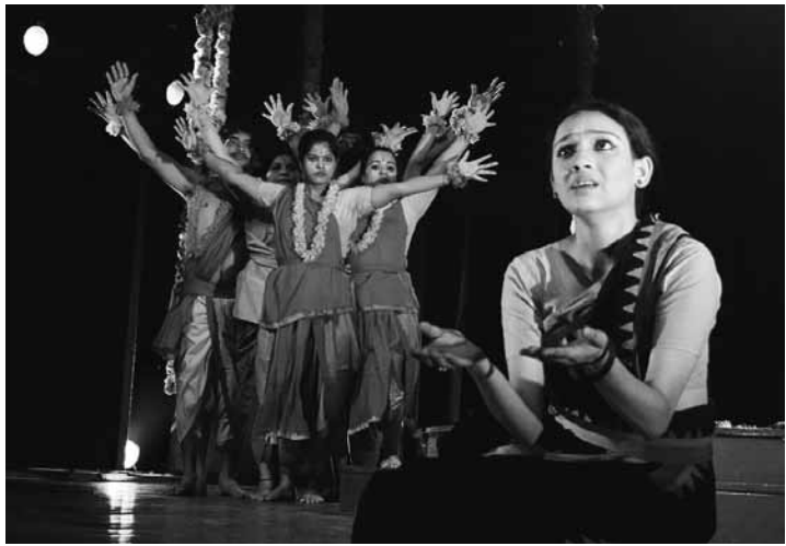
A scene from the play 'Chandalika' staged during ongoing International Literature and Arts Festival 'Vishwa Rang' at Ravindra Bhavan in Bhopal on Wednesday