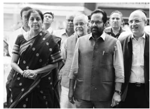
Nirmala Sitharaman and party leaders leave after meeting the Election Commission officials in New Delhi on Friday

auegations are not only viola-tive of the Model Code of Conduct but also fall under corrupt practices, as described in the Representation of People Act. The court had never said such a thing, he said. "The Congress President is using abusive words and state-ments that are untrue. He is repeatedly calling the Prime Minister 'chor' without any evidence despite the Supreme Court's December verdict in the Rafale case, and also putting words into the mouth of Supreme Court." Sitharaman told reporters. "We have complained to the EC that neither the Supreme Court on the