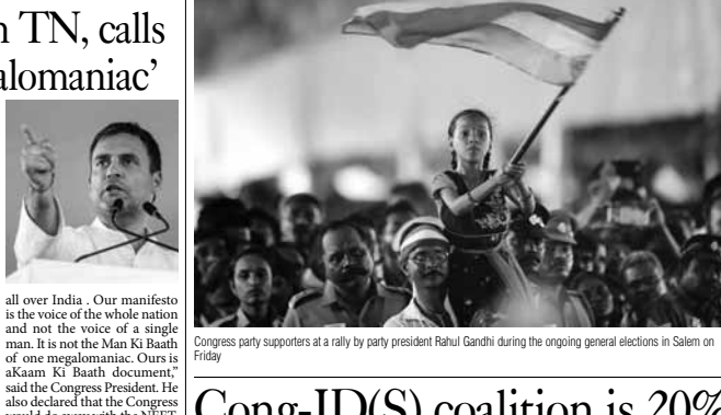
Congress party supporters at a rally by party president Rahul Gandhi during the ongoing general elections in Salem on Friday

entire speech of Rahul Gandhi was a charge sheet against Prime Minister Modi whom he