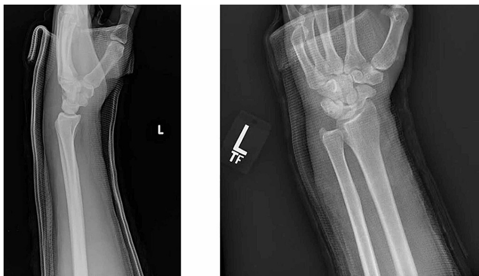
FIGURE 4: Post-reduction radiographs including lateral (left) and posteroanterior (right) views

After receiving informed consent from the patient, conscious sedation was performed with the assistance of the emergency room provider. Closed reduction of the left volar DRUJ dislocation was successful by applying slight distraction to the radius and ulna and applying a dorsally directed force to the ulnar head. As the wrist was slightly pronated with continuous direct pressure being maintained, an audible click was heard, and reduction was appreciated. Once the DRUJ was reduced, the wrist was passively taken through the full normal range of motion including flexion, extension, and pronosupination. Post-reduction stability was assessed throughout motion and no instability was noted. Range of motion and stability was comparable to the contralateral uninjured wrist after reduction. The patient was immobilized in neutral forearm rotation and 90 degrees of elbow flexion using a well-molded sugar tong fiberglass splint. Post-reduction radiographs were obtained and confirmed the successful reduction of the DRUJ (Figure 4).