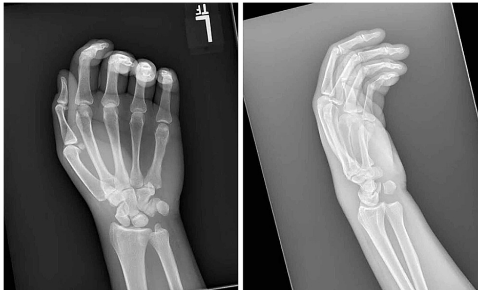
FIGURE 1: Initial posteroanterior (left) and lateral (right) radiographs of the injury

A CT scan was also obtained to look for any associated injuries or fractures. CT confirmed the isolated volar dislocation of the ulnar head from the distal radial sigmoid notch. This was best seen on the axial cut at the level of the DRUJ (Figure 2). A 3D reconstruction of the scans was also performed to obtain additional information on the injury and aid with closed reduction and treatment (Figure 3).