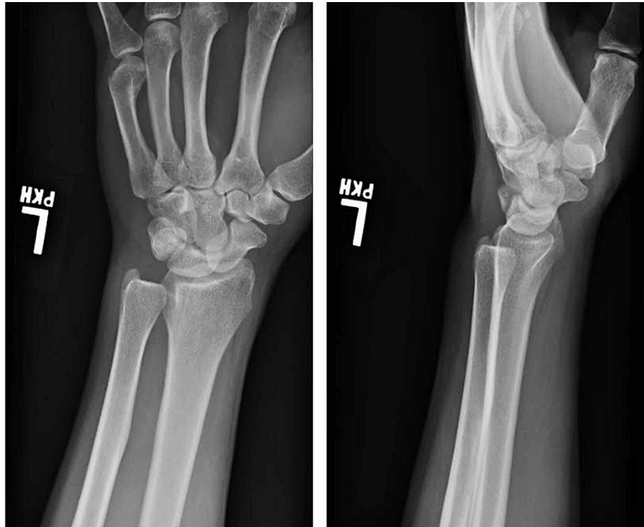
FIGURE 5: Posteroanterior (left) and lateral (right) radiographs taken at follow-up demonstrating maintenance of reduction without recurrence of volar ulnar dislocation

The patient was seen for a follow-up in the orthopedic clinic the subsequent week, and repeat radiographs of the left wrist demonstrated a maintained reduction of the DRUJ. The patient's pain had improved, and he was instructed to keep the wrist immobilized for another four weeks. Two weeks later, the patient presented once again to the emergency department after his original fiberglass splint had got wet and loosened, requiring a new splint to be applied. Repeat radiographs again showed a concentric reduction. The patient's splint got wet and loosened once again at six weeks from the date of his original injury, and he was transitioned to a prefabricated removable wrist splint. At that time, his pain had continued to improve and he had full range of motion of the left wrist. The radiographs from the outside emergency department during this last encounter demonstrating maintenance of reduction without recurrence of volar ulnar head dislocation are presented below (Figure 5). Unfortunately, this patient was lost to long-term orthopedic follow-up due to a period of incarceration, but he has had subsequent medical encounters within our health system nearly three years after his original injury without noted residual left wrist pain, diminished range of motion, or any additional wrist complaints, and a satisfactory clinical recovery can be inferred.