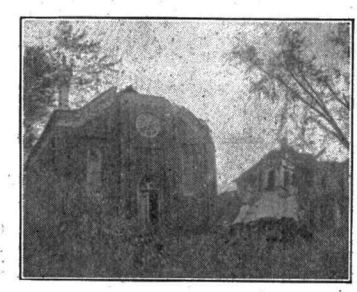
AFTER THE STORM

Why continue to run unnecessary risks when a few cents for each day in the year would distribute the responsibility among our nearly nineteen thousand policyholders?