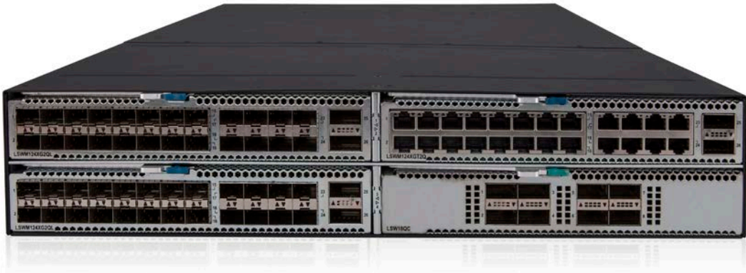
HPE FlexFabric 5930 4-slot Switch