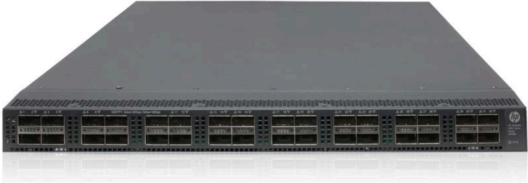
HPE FlexFabric 5930 32QSFP+ Switch