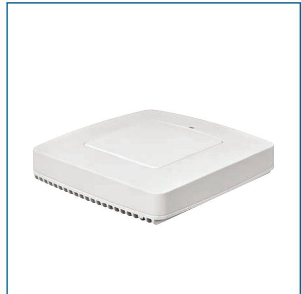
SCRN-340 | Figure 1

The SCRN-340 is deployed as part of SpiderCloud® Enterprise Radio Access Network (E-RAN). E-RAN hides the complexity of radio management and mobility and provides customers with a single touch point to aggregate and manage a large network of LTE small cells.