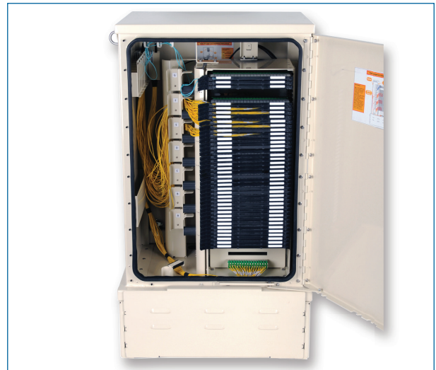
OptiTect HD Cabinet, 896-Fiber, Pad Mount (Front View) | Photo CRR2432