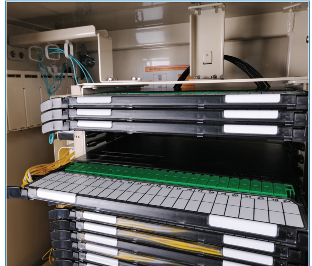
OptiText HD Cabinet, 896-Fiber, Pad Mount (Centrix Cassette) | Photo CRR2429