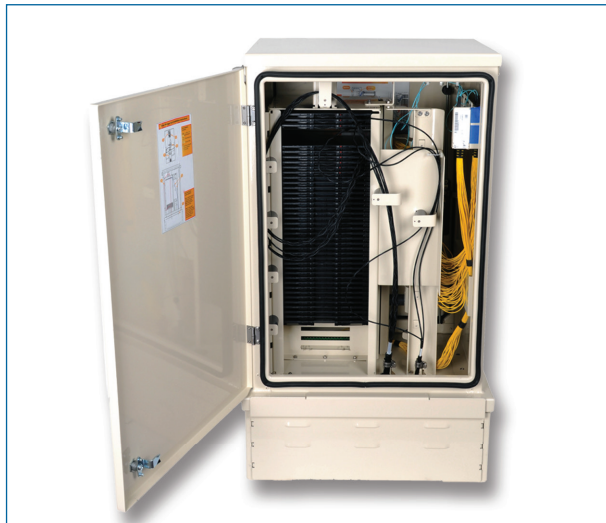
OptiTect HD Cabinet, 896-Fiber, Pad Mount (Back View) | Photo CRR2435