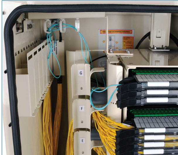
OptiText HD Cabinet, 896-Fiber, Pad Mount (Splitter Array) | Photo CRR2421