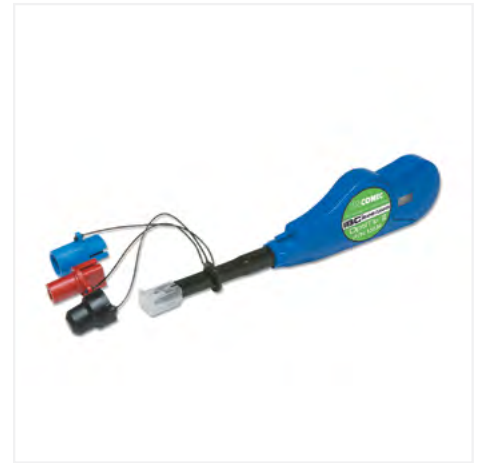
OptiTip Cleaning Tool