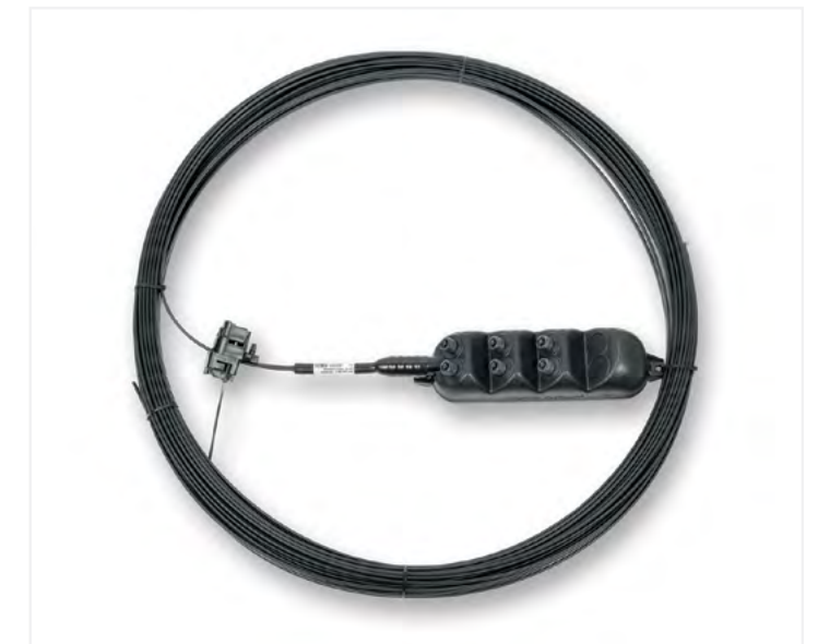
MF2 Stubbed Terminal

MF2 multiport terminals feature OptiTip® multifiber connector technology to enable connectivity to remote radio units (RRU). Available unstubbed to use OptiTip pigtails as a feeder, stubbed bare ended or unstubbed with OptiTip connectors.