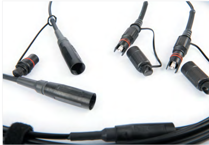
2-Fiber OptiTap In-Line Assembly