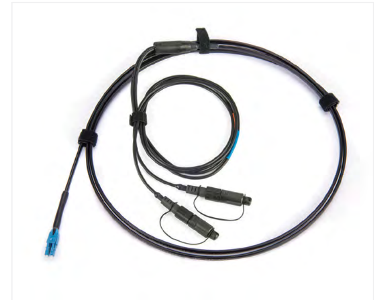
Dual OptiTap to Uniboot LC Duplex