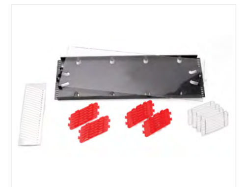
Splice Tray (2527)