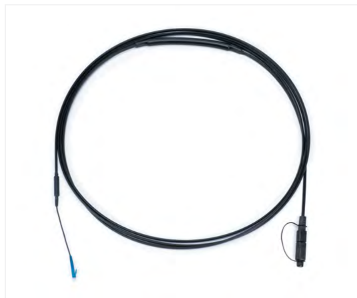
OptiTap to LC Simplex

The Corning small cell drop assemblies are rugged, self-supported, and crush-resistant. The OptiTap to LC assembly is made for use with Corning's multiport terminals in both the buried and aerial environments. This small cell drop cable assembly allows for a simplex, single-fiber connection from the multiport to the radio, removing the requirement for additional hardware. Two options with differing furcation lengths allow for compatibility with either 1) Samsung radios utilizing JonHon, Ericsson radios utilizing Full AXS or Nokia AirScale radios or 2) Ericsson 220x and 440x radios.