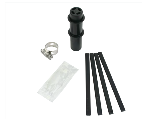
4-Port Grommet for Flat Drop Cable (2178-4PGA)