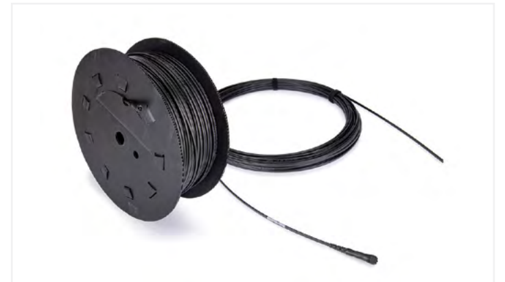
SST OptiTip Pigtail

OptiTip interconnect harness assemblies are designed for use in outside plant fiber access networks with fiber distribution terminals. This innovative cable assembly solution provides enhanced design flexibility, increased deployment speed, and reduced installation cost. The OptiTip MT connector design delivers superior durability and reliability for network-point connections up to 12 fibers and is packaged on a reel.