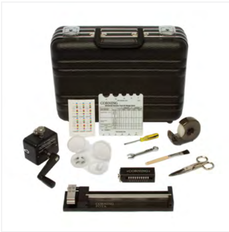
Ribbon Combo Toolkit