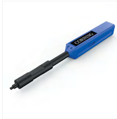
Pushlok Cleaning Tool