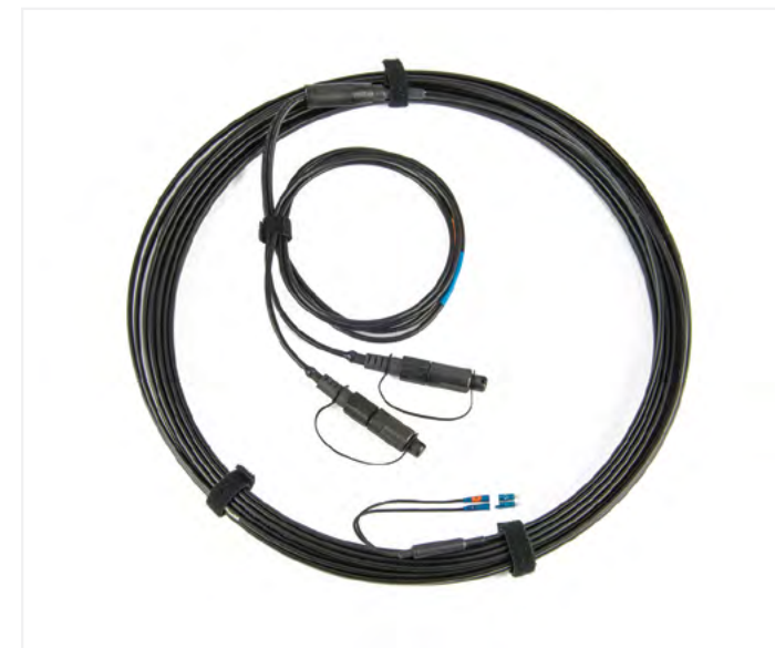
Dual OptiTap to LC Duplex

The Corning small cell drop assemblies are rugged, self-supported, and crush-resistant. The dual OptiTap to LC Duplex drops are made for use with the Corning multiport terminals in both the buried and aerial environments. This assembly allows for a duplex, 2-fiber connection from the multiport to the radio, removing the requirement for additional hardware. Two options with differing furcation lengths on the LC Duplex end allow for compatibility with either 1) Ericsson 2203 and 2205 radios or 2) Ericsson RRUS radios, as well as hardware utilizing OCTIS style connections with a uniboot design.